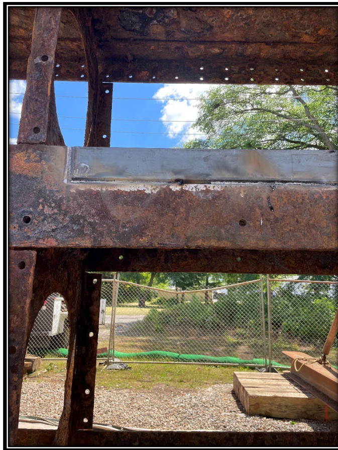
Figure:1 Additional repair area on East Tide Gate.

Progress Report #5 Monday, June 24, 2024 to Friday, July 5, 2024