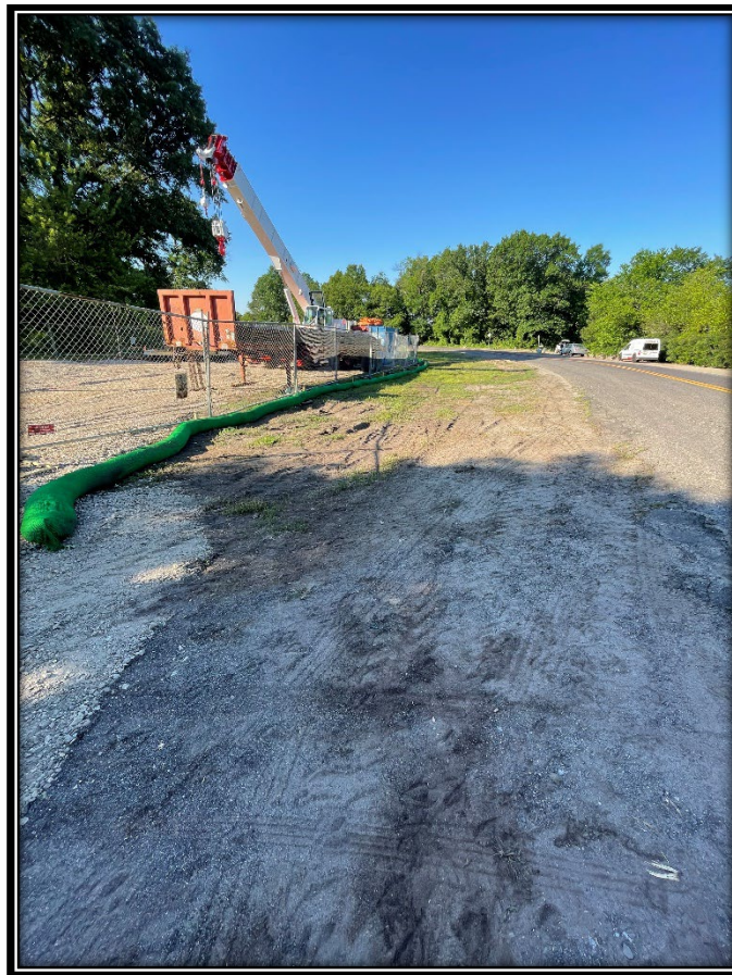
Figure:1 Driscoll Construction set up staging area on east side of North Park Drive.

Progress Report #3 Monday, May 27, 2024 to Friday, June 7, 2024