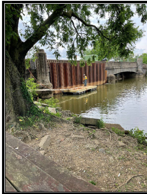
Figure 3: Driscoll Construction continues dewatering.