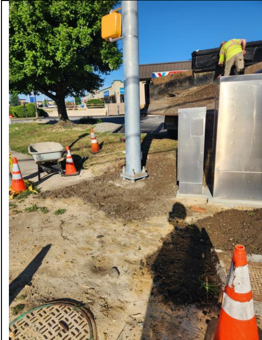
Photo A-1 of 1 Date Taken: July 2, 2024 Description: Stabilization (P.S 11 OF 16 Electrical Plan, STA 6+25)