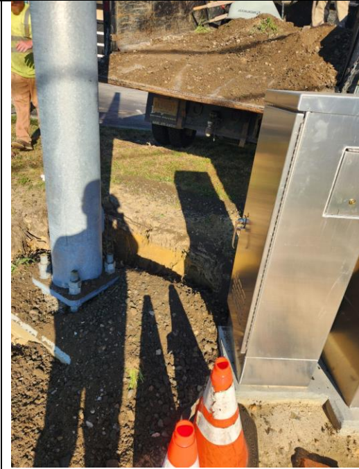
Photo A-2 of 2 Date Taken: July 2, 2024 Description: Prior to stabilization (P.S 11 OF 16 Electrical Plan, STA 6+25)