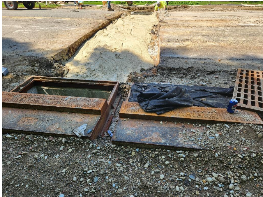
Figure 2. Process of Inlet installation across Berlin Road