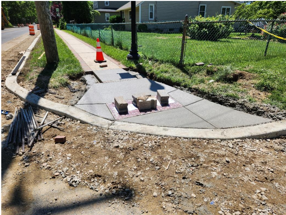
Figure 1. Concrete ADA ramp placement on Berlin Rd.