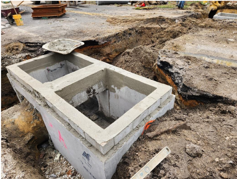
Figure 1. Inlet and RCP installation for road crossing at STA 86+55