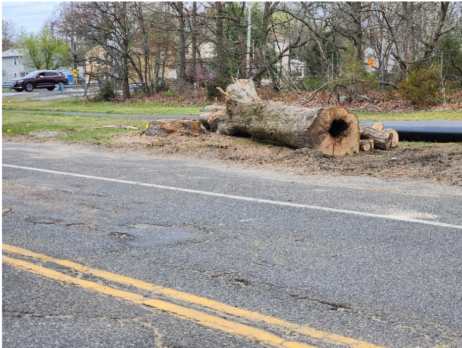
Figure 2. Tree removal along Berlin Road