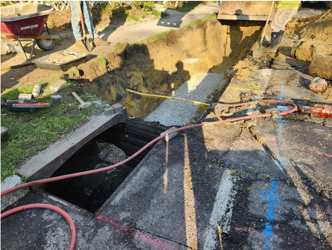
Figure 1. Open inlet and pipe placement trench at STA 63+50. The drainage subcontractor, Asphalt Paving Systems, began pipe replacement at this location.