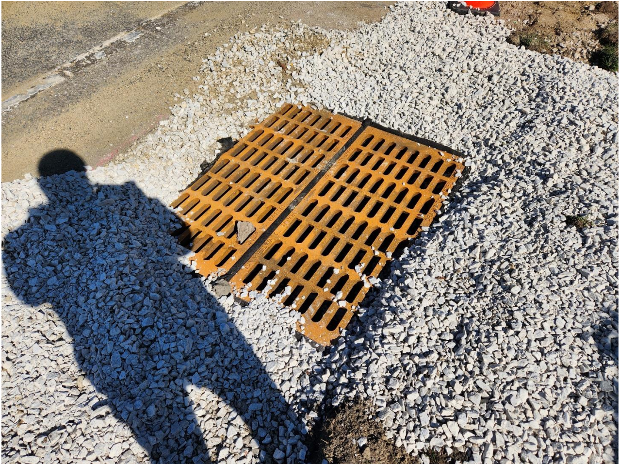
Figure 2. Completed inlet #5 Type B, placed at STA 61+70. The drainage subcontractor, Asphalt Paving Systems, installed an inlet filter and placed No.57 coarse aggregate.