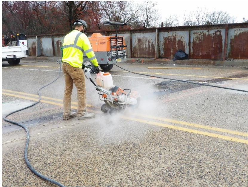
Photo 11 – Workers saw-cut along the center pier deck joint to begin removal and replacement