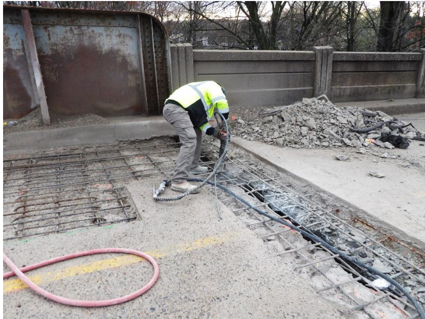
Photo 1 – Workers continued demolition of the south abutment deck joint