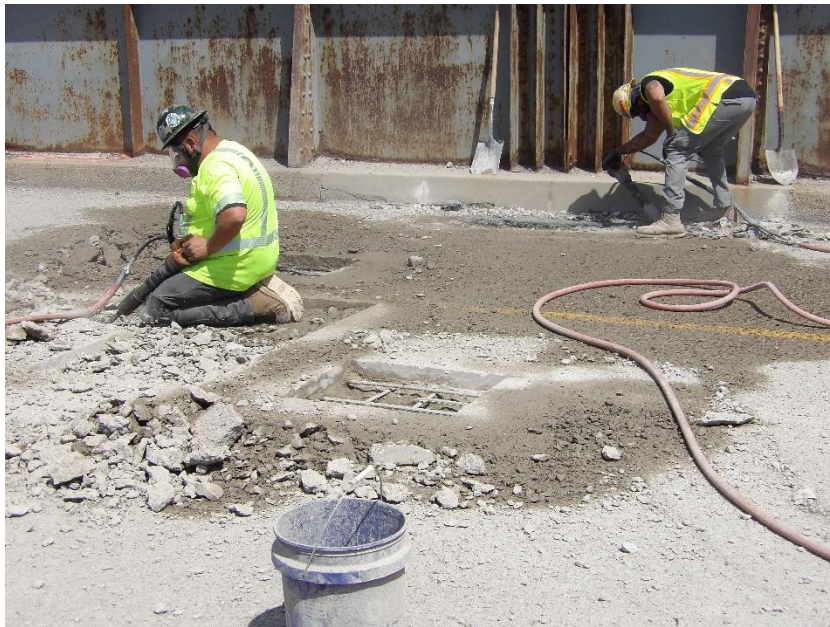
Photo 7 – Concrete chipping and debris removal continued throughout the week