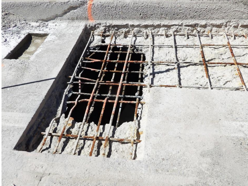
Photo 4 – Typical “Type C” deck spall where the concrete has deteriorated through the deck