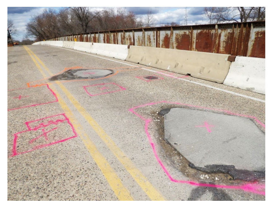
Photo 2 - Resident Engineer located and marked out deteriorated concrete for removal

Charles J. DePalma Complex 23ll Egg Harbor Road Lindenwold, NJ 0802l Phone 856.566.2980 Fax 856.566.2988 highway@camdencounty.com