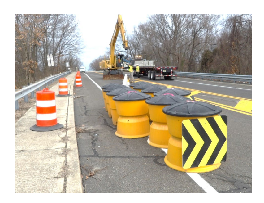
Photo 1 – Contractor began mobilization and set-up traffic control, closing Haddon Avenue southbound

Bi-Weekly Progress Report No. 1 3-4-2024 through 3-15-2024