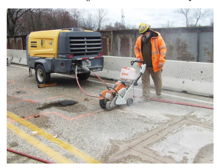
Photo 5 – Workers continued to saw-cut and remove deteriorated concrete