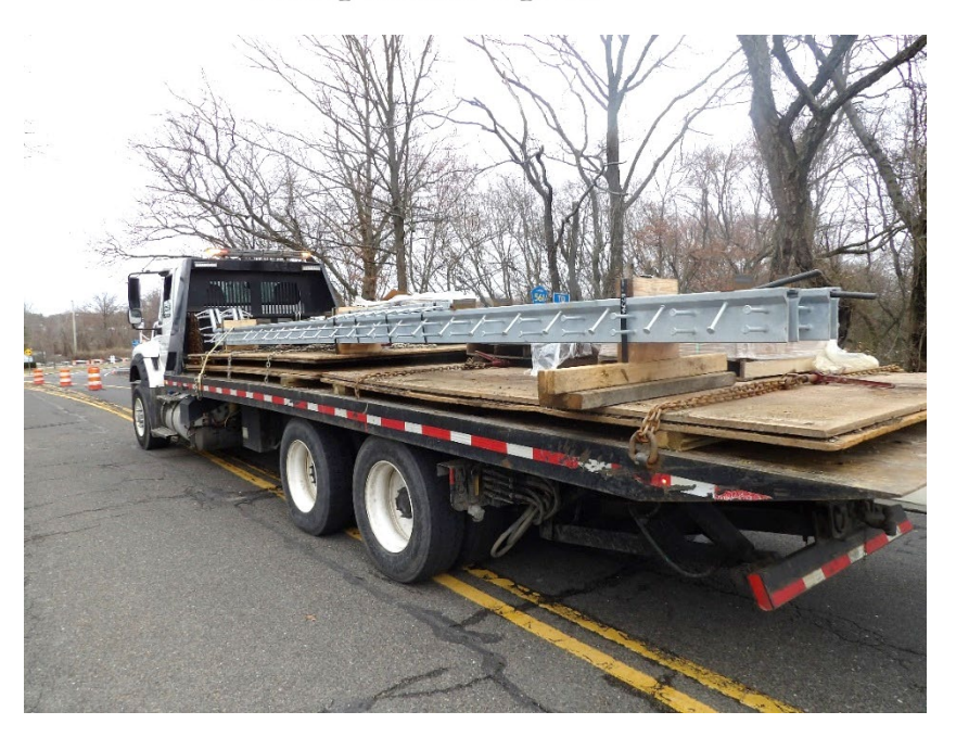
Photo 6 – Various materials and equipment were mobilized during the week