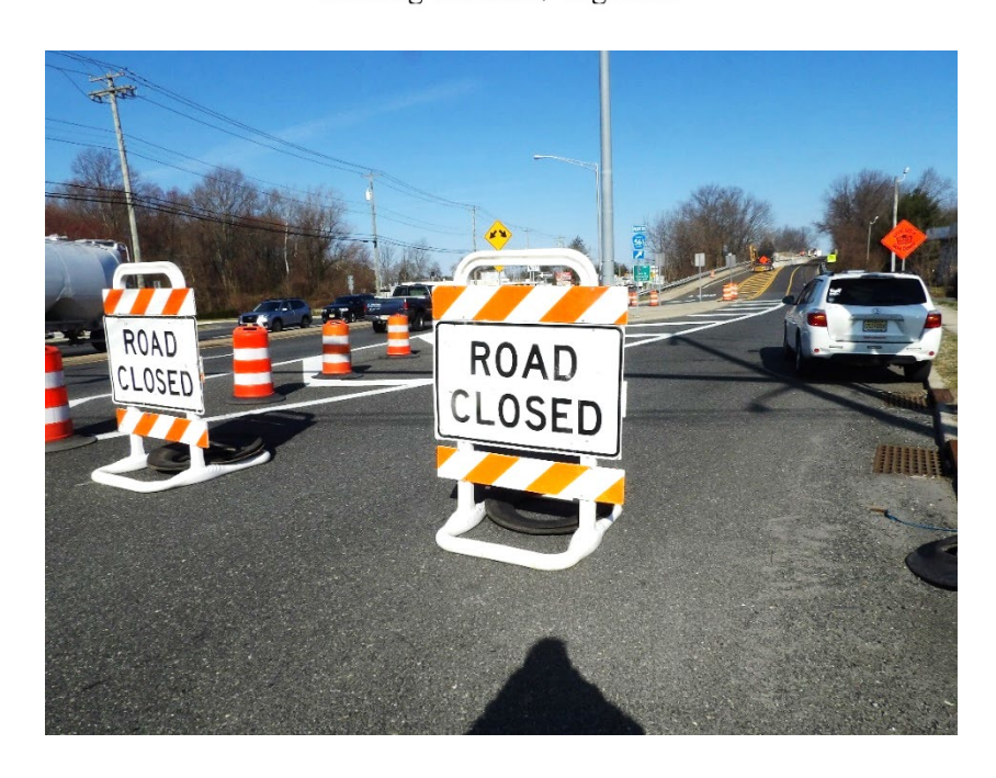
Photo 8 – Traffic safety concerns forced the closure of Hadon Avenue in each direction for the duration of the project