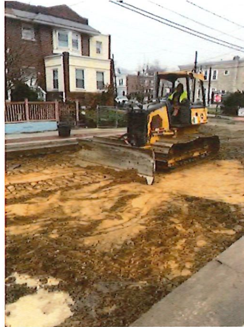
Figure 3: Grading Subbase