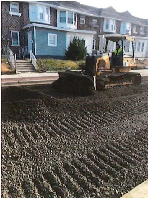
Figure 4: Leveling DGA Base Course