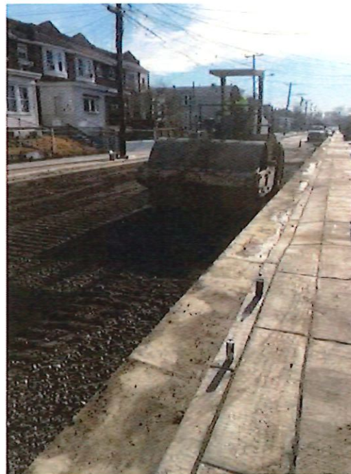
Figure 5: Compacting DGA Base Course