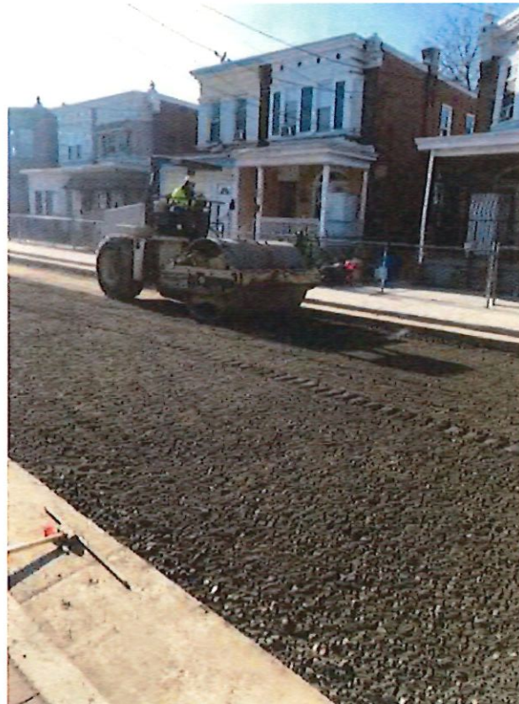
Figure 1: Compacting DGA Base Course