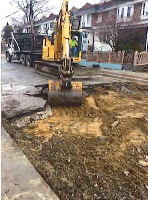
Figure 2: Excavation of Existing Roadway