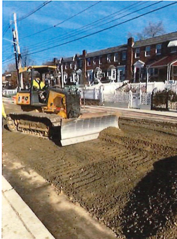
Figure 1: Leveling DGA Base Course