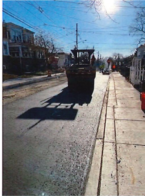
Figure 3: Compacting HMA Base Course