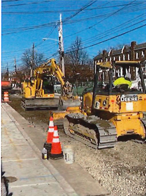
Figure 2: Placement of DGA Base Course