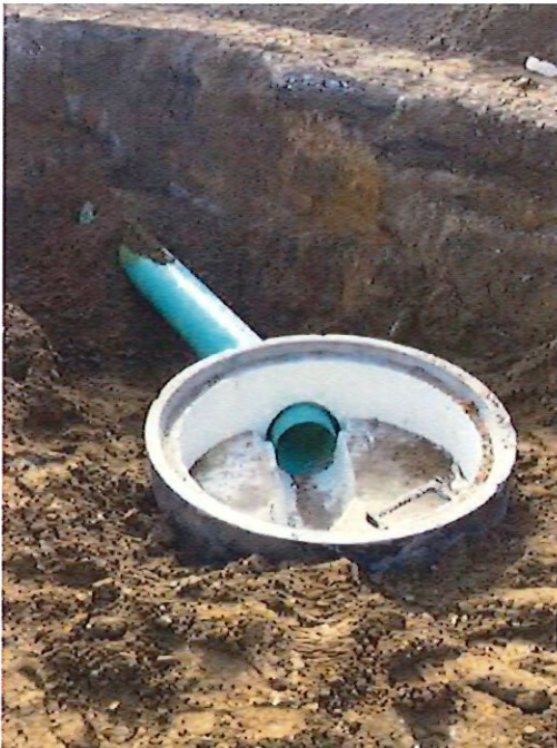
Figure 4: Installing Manhole, 4' Diameter