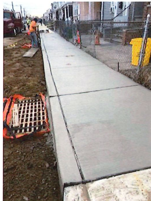
Figure 5: Concrete Sidewalk, 5" Thick