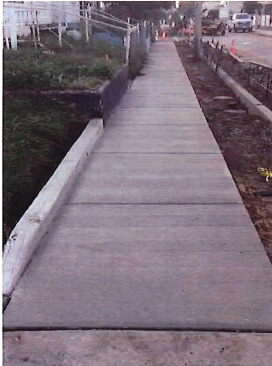
Figure 1: Concrete Sidewalk