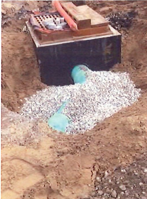
Figure 2: Structures and Pipe Installation