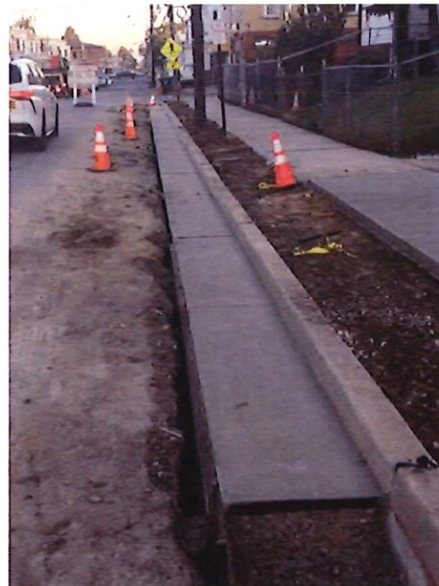
Figure 5: Concrete Curb & Gutter