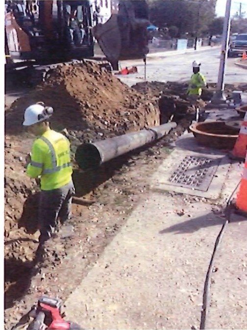
Figure 3: Ductile Iron Pipe Installation