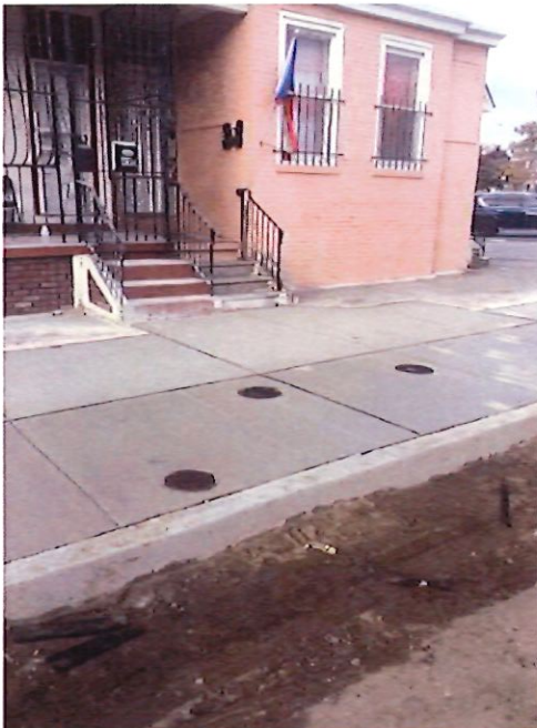
Figure 4: Resetting Utilities