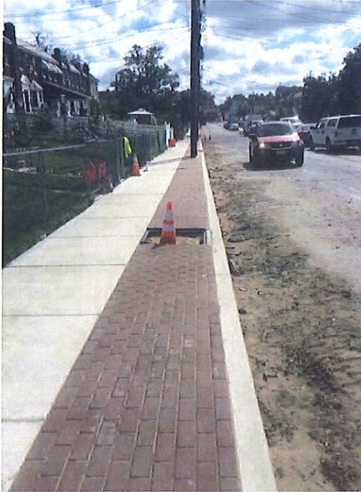
Figure 2: Brick Pavers