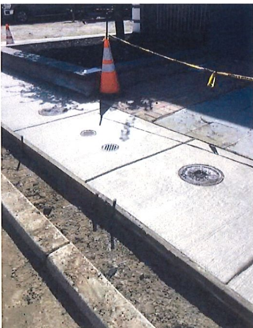
Figure 4: Resetting Utilities