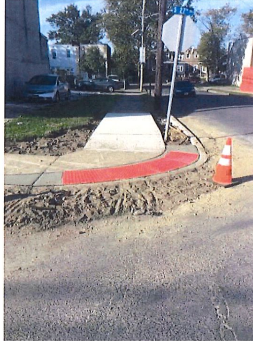
Figure 3: ADA Compliant Curb Ramp