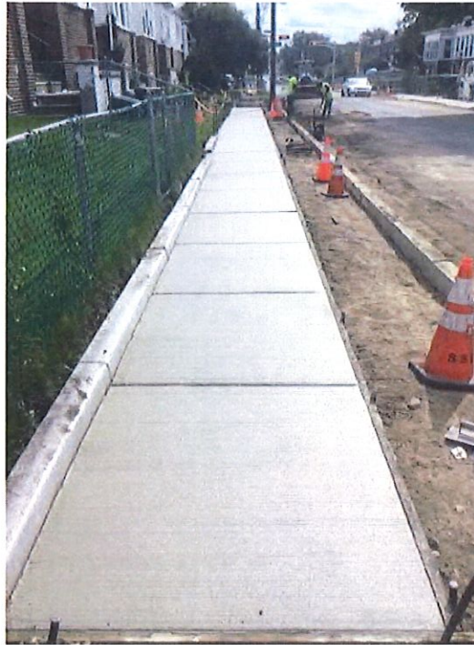
Figure 1: Concrete Sidewalk