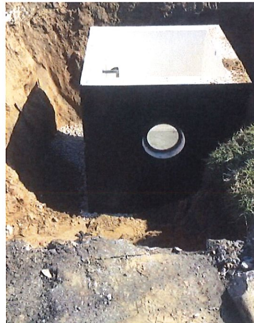
Figure 5: Installing Drainage Structures