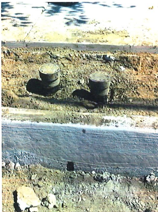
Figure 4: Reset Sewer Cleanouts