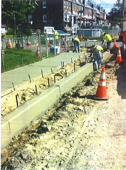
Figure 2: Concrete Curb and Sidewalk