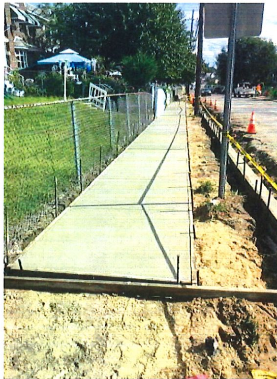
Figure 1: Concrete Sidewalk