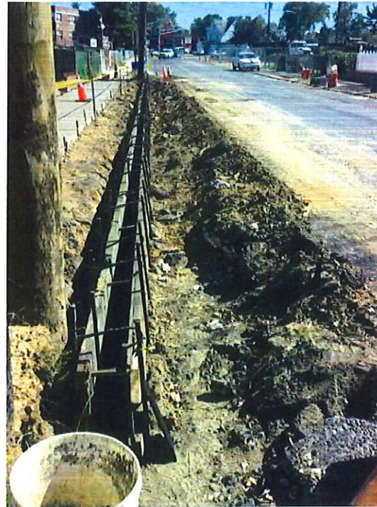
Figure 3: Forming Concrete Curb