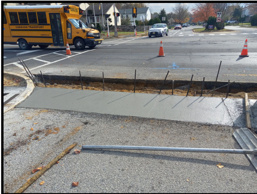
Photograph 6 – Concrete crew installing driveway apron at entrance to Cooper Elementary School.