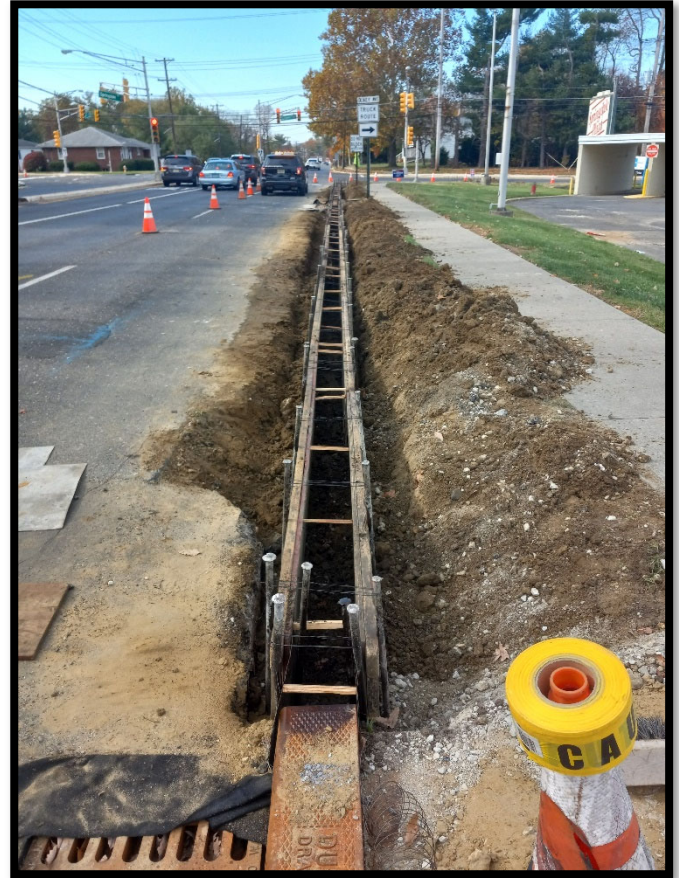
Photograph 2 – Forms set for concrete curb pour on left side of baseline adjacent to Springdale Plaza Shopping Center.