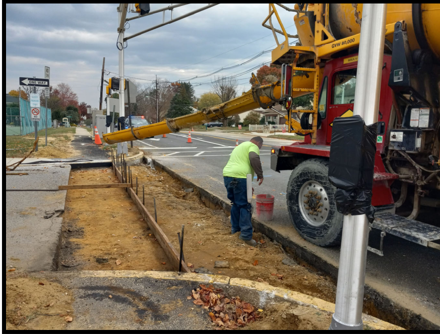
Photograph 5 – Concrete crew preparing for driveway apron installation at entrance to Cooper Elementary School.