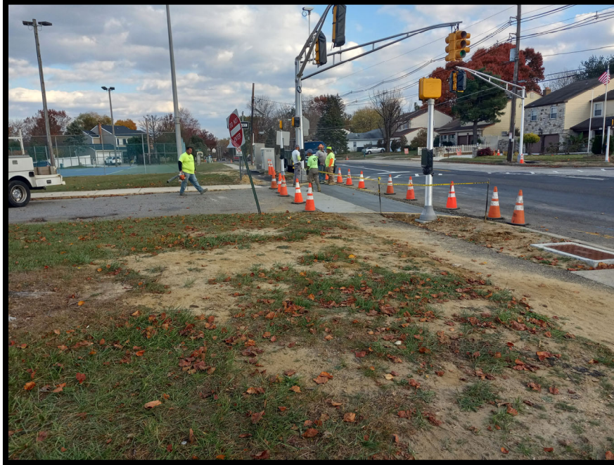
Photograph 7 – Concrete crew installing driveway apron at entrance to Cooper Elementary School.