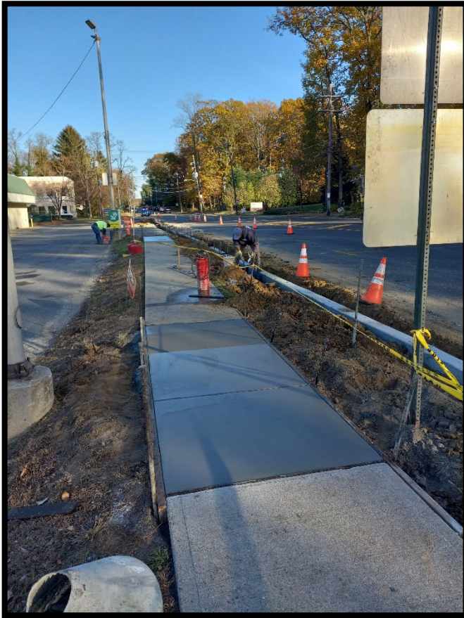
Photograph 3 – New concrete curb and sidewalk installed on left side of baseline adjacent to Springdale Plaza Shopping Center

Department of Public Works Charles J. DePalma Complex 2311 Egg Harbor Road Lindenwold, NJ 08021 Phone 856.566.2980 Fax 856.566.2988 highway@camdencounty.com CamdenCounty.com