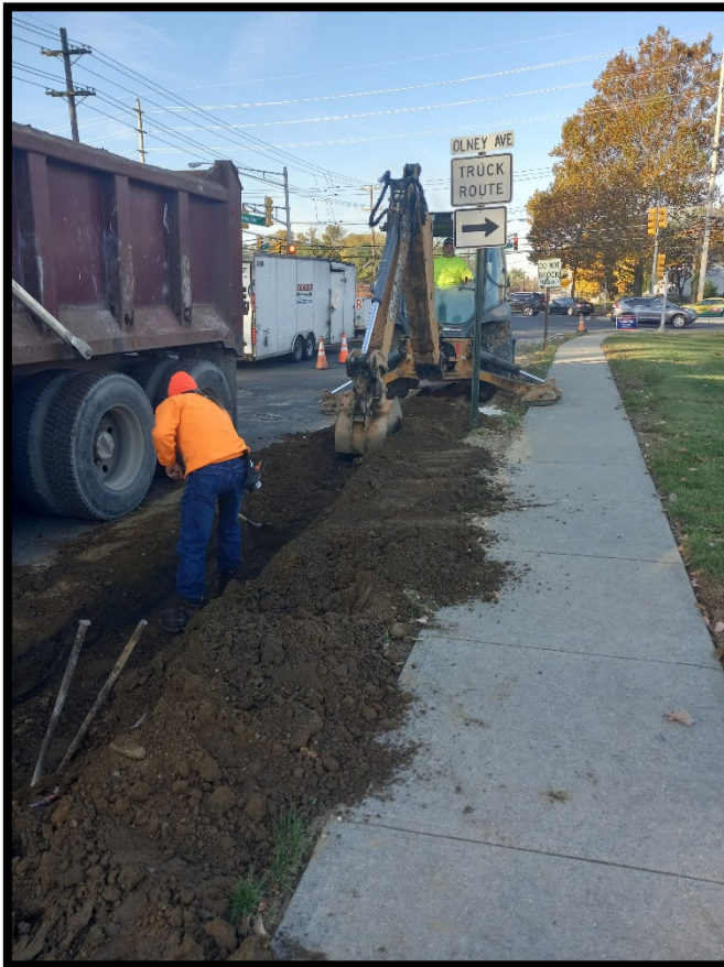
Photograph 1 – Concrete crew excavating for concrete curb pour on left side of baseline adjacent to Springdale Plaza Shopping Center.