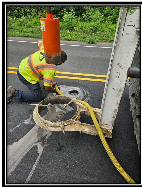
Figure: 3 – AID taking HMA cores of newly paved roadway to test for thickness and airvoids