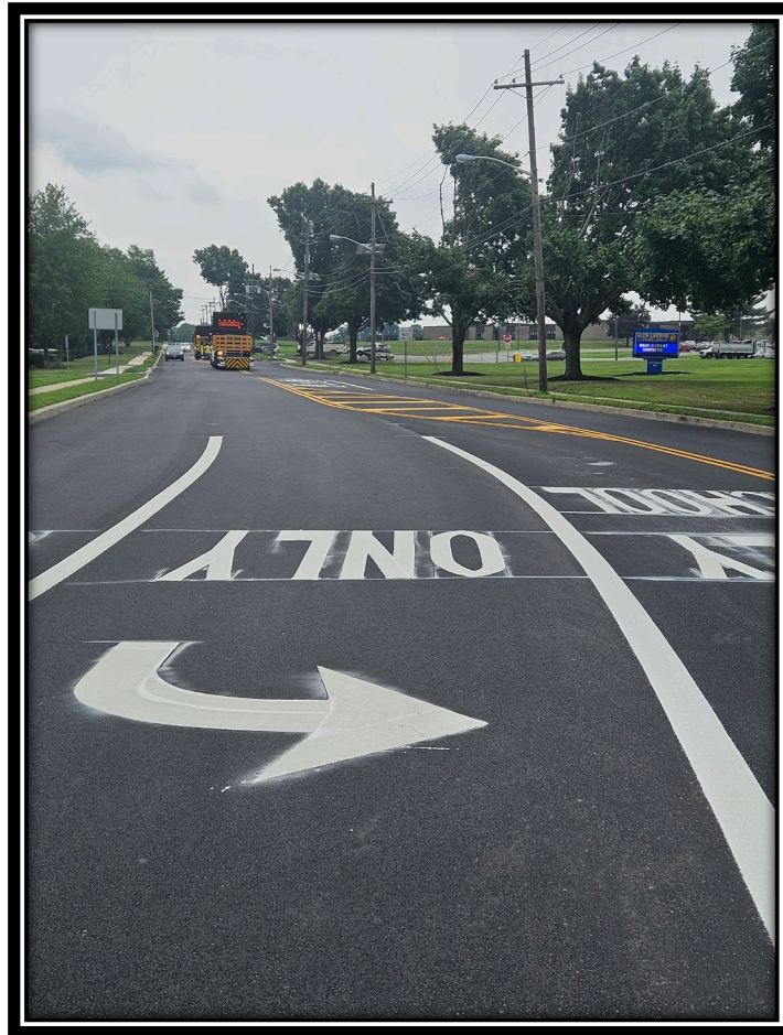
Figure: 1 – Installation of thermoplastic markings approaching the intersection with Chews Landing Road