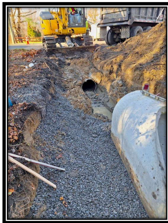
Figure: 3 – Installation of 24” Flared End Section between Tall Oaks Drive and Mt. Pleasant Road