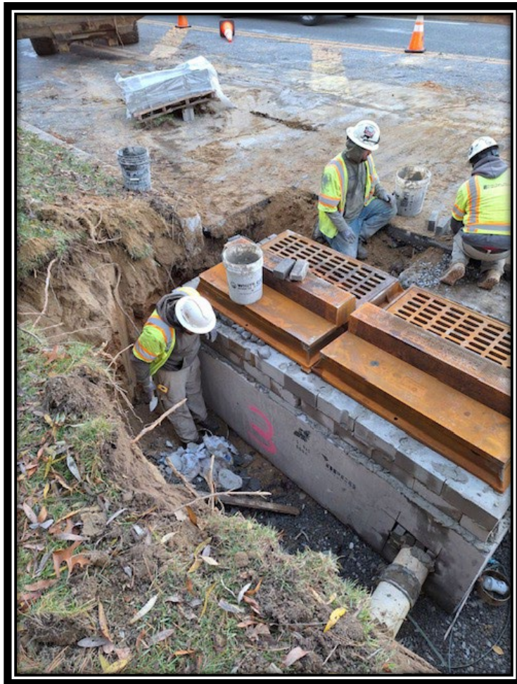
Figure: 1 – Installation of Type Double B Inlet along the southbound lane between Golf View Drive and Hider Lane