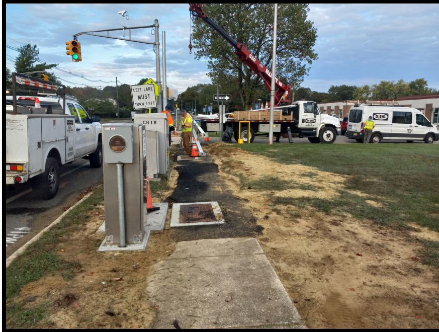
Photograph 5 – Electrical subcontractor pulling wires and installing cross arms for the new traffic signal at S. Birchwood Park Drive intersection.