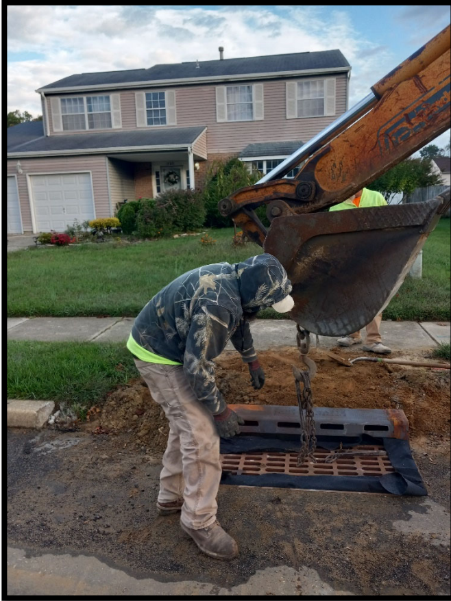
Photograph 3 – Pipe subcontractor installing curb pieces at new “B” inlets.