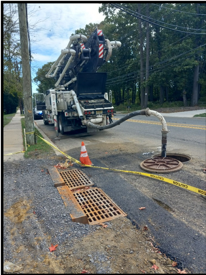
Photograph 1 – Pipe subcontractor pressure grouting the existing 18" CMP per Work Directive #5.