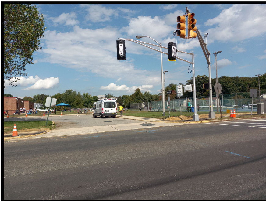
Photograph 6 – New traffic signal installed at the entrance to Cooper Elementary School at the S. Birchwood Park Drive intersection.