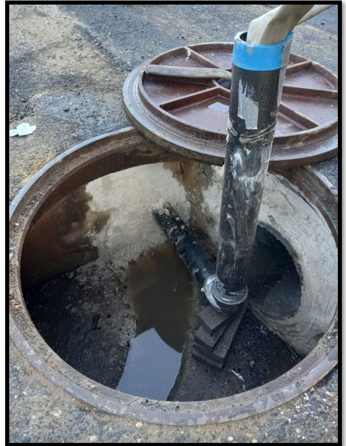
Photograph 2 – Pipe subcontractor pressure grouting the existing 18" CMP per Work Directive #5.