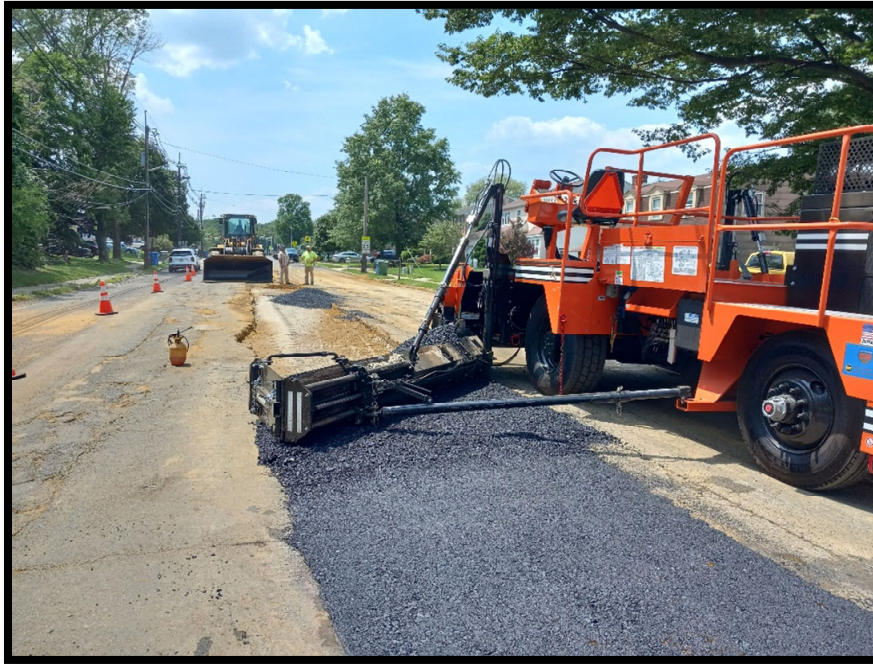
Photograph 7 – Temporary Asphalt Trench Restoration being placed after RCP storm pipe and manholes installed.