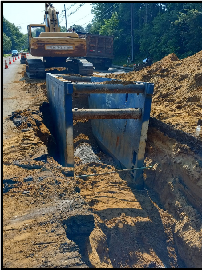
Photograph 1 – The pipe subcontractor is utilizing a trench box to assist with installation of 30" RCP storm pipe.