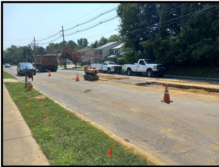
Photograph 4 – Temporary Asphalt Trench Restoration being placed for the 30" RCP storm pipe.