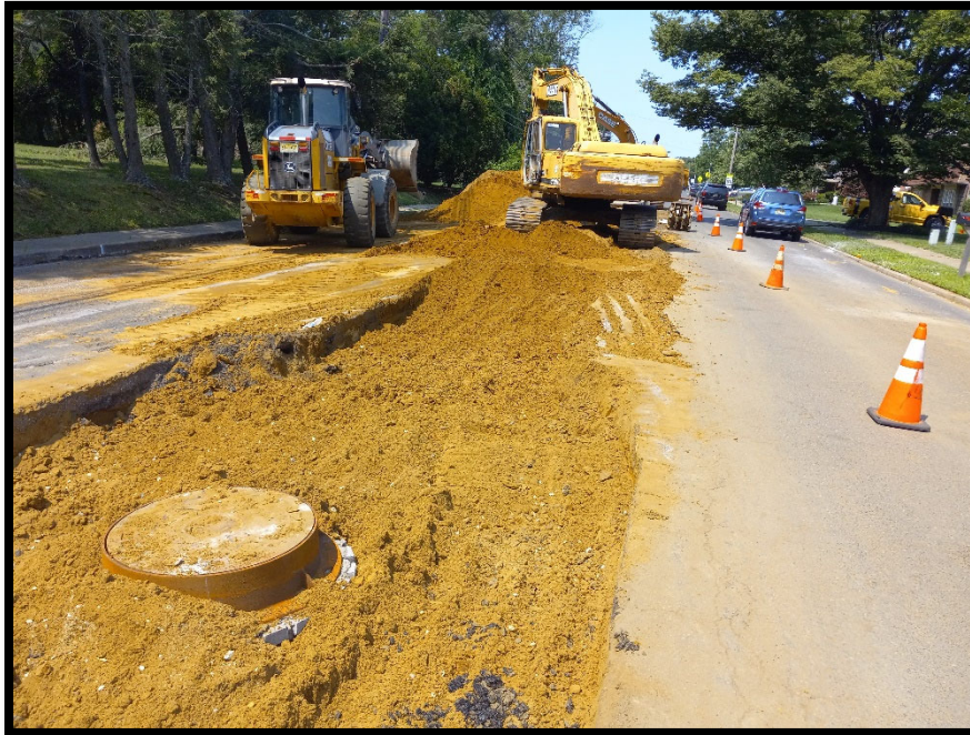
Photograph 3 – Backfilling for trench restoration of 30" RCP storm pipe.

Department of Public Works Charles J. DePalma Complex 2311 Egg Harbor Road Lindenwold, NJ 08021 Phone 856.566.2980 Fax 856.566.2988 highway@camdencounty.com CamdenCounty.com