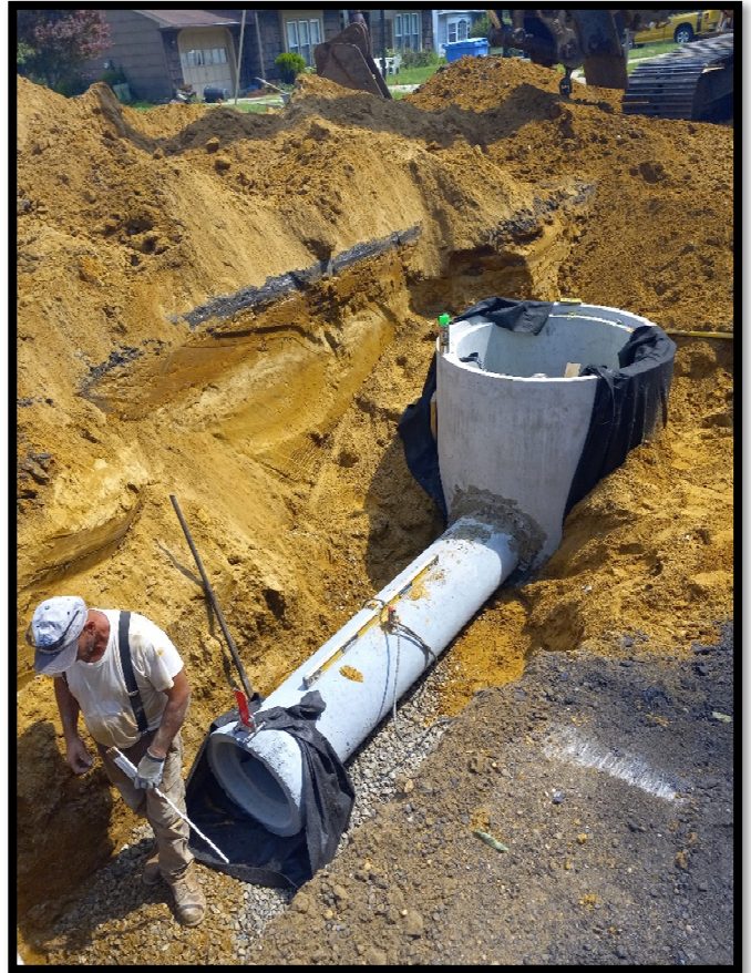
Photograph 6 – Manhole set and next run of RCP storm pipe installed.