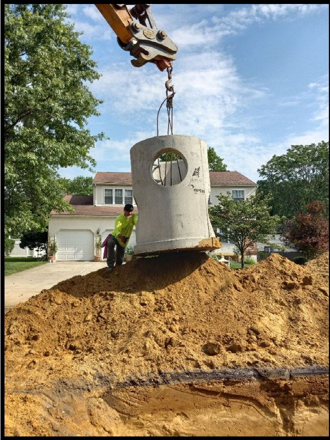
Photograph 5 – Preparing 5' Diameter Manhole for installation.

Department of Public Works Charles J. DePalma Complex 2311 Egg Harbor Road Lindenwold, NJ 08021 Phone 856.566.2980 Fax 856.566.2988 highway@camdencounty.com CamdenCounty.com