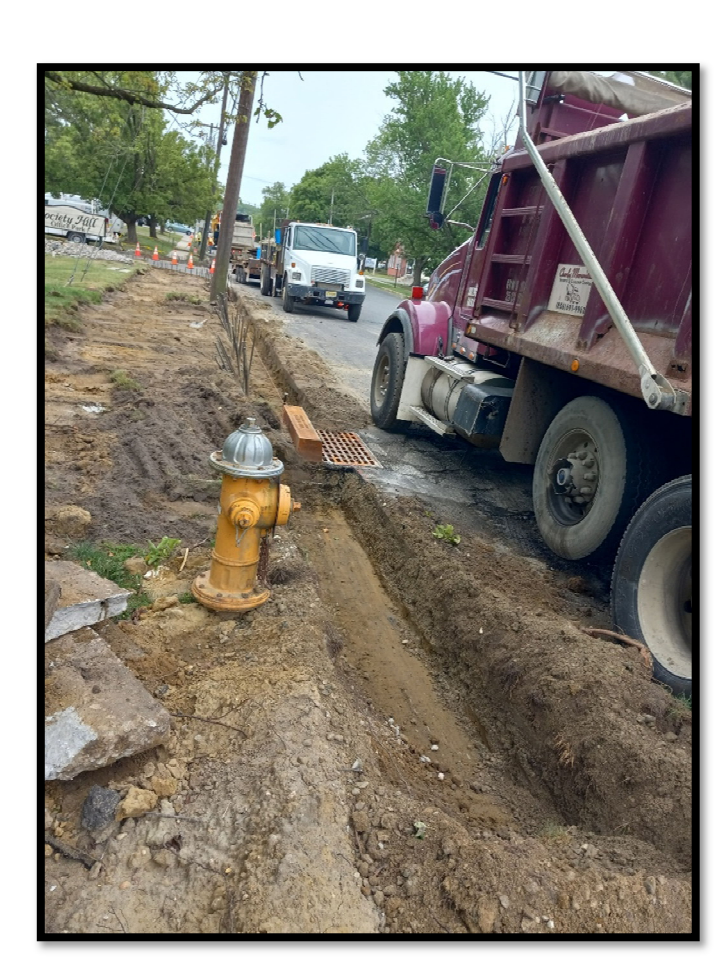
Photograph 3 – The concrete crew began installing concrete curb between Route 70 and Springdale Road.

Department of Public Works Charles J. DePalma Complex 23ll Egg Harbor Road Lindenwold, NJ 0802l Phone 856.566.2980 Fax 856.566.2988 highway@camdencounty.com CamdenCounty.com