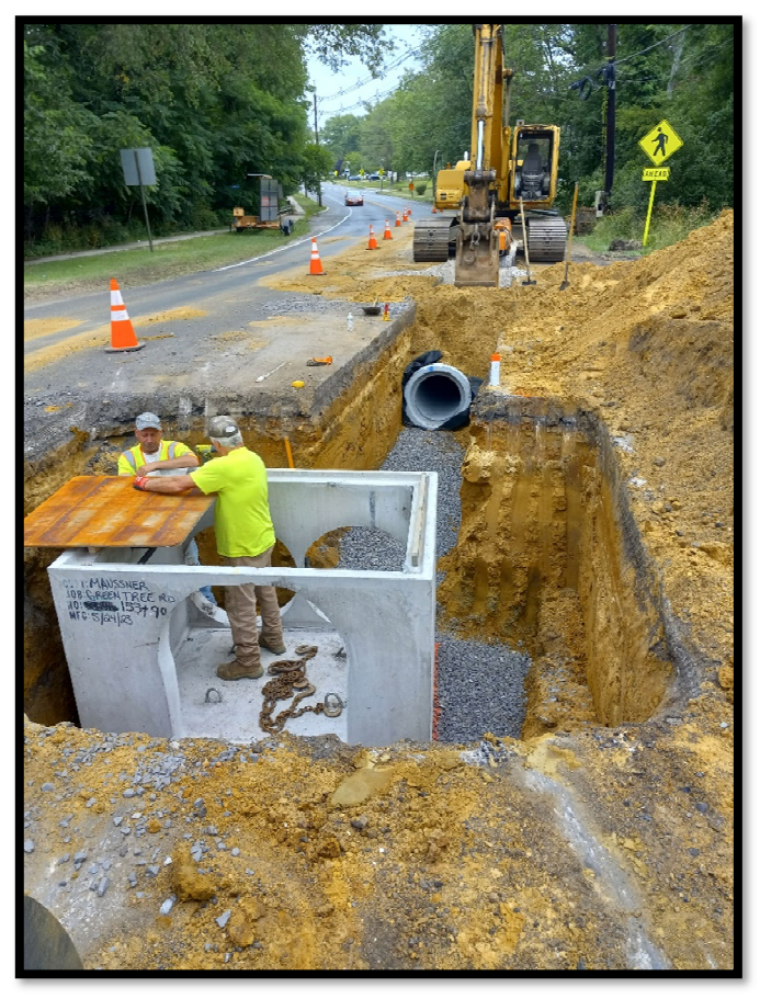
Photograph 4 – The pipe subcontractor installing the Diverter Manhole at Station 154+00.