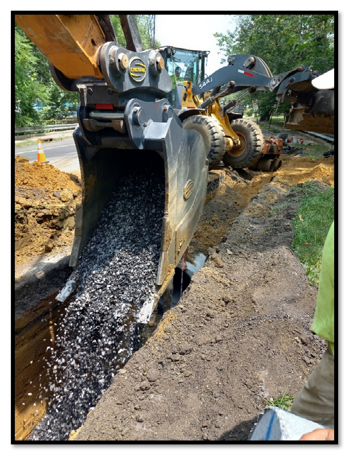
Photograph 2 – The pipe subcontractor began installing 24" RCP at the eastern end of the project near the County border heading towards the Diverter Manhole.