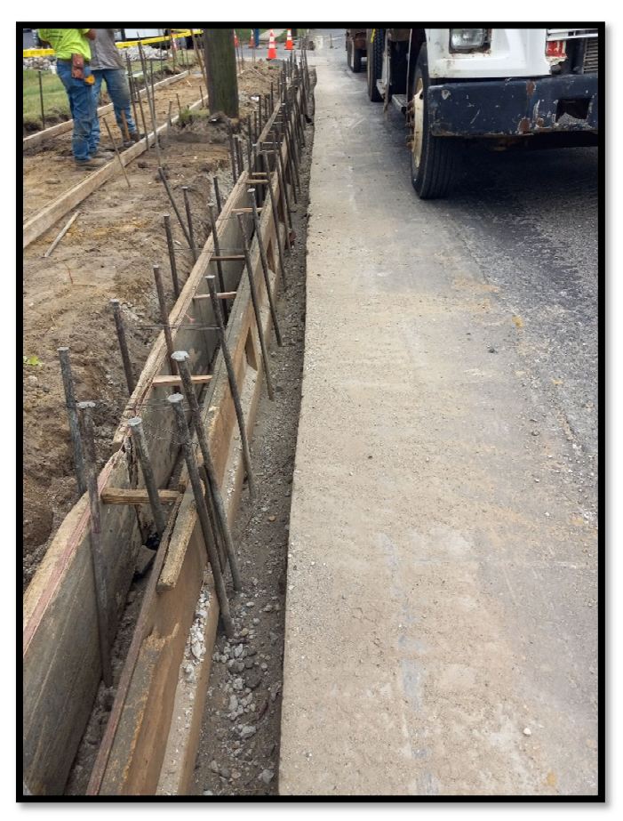
Photograph 4 – Curb forms installed in preparation of a concrete pour.