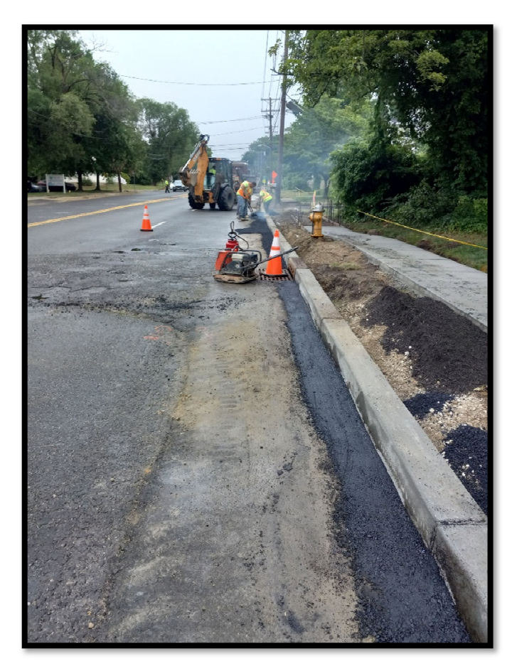
Photograph 6 - Asphalt restorations being completed after concrete curb is installed.