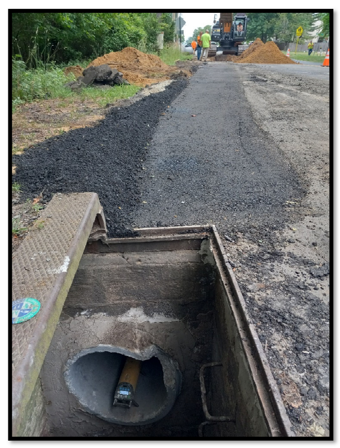
Photograph 3 –24" RCP installed at the eastern end of the project near the County border heading towards the Diverter Manhole. Temporary Asphalt Trench Restorations completed.