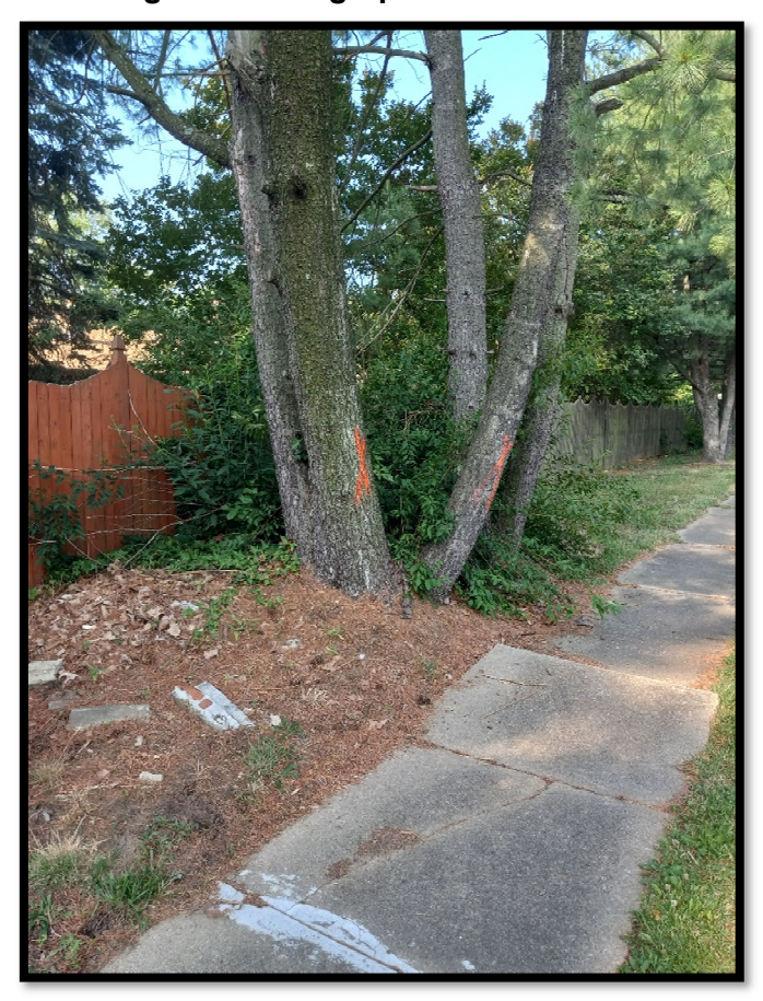
Photograph 1 – The tree subcontractor continued to remove trees in accordance with the Contract Documents.