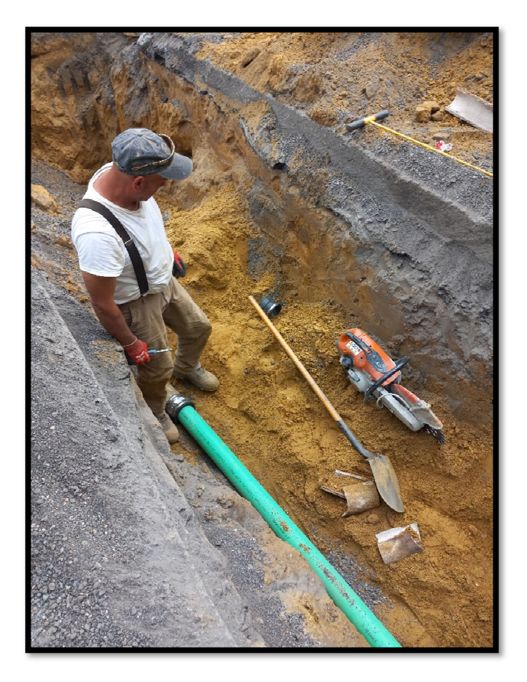
Photograph 2 – Permanent sewer lateral replacements completed at 1883 and 1887 Greentree Road.

Photograph 1 – Permanent sewer lateral replacements completed at 1883 and 1887 Greentree Road.