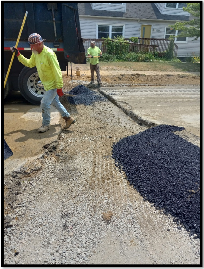
Photograph 3 Trench restorations for lateral replacements permanent sewer completed at 1883 and 1887 Greentree Road

Department of Public Works Charles J. DePalma Complex 2311 Egg Harbor Road Lindenwold, NJ 08021 Phone 856.566.2980 Fax 856.566.2988 highway@camdencounty.com CamdenCounty.com