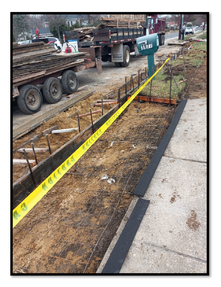
Photograph 4 – Welded wire fabric and expansion joint material being laid out in preparation of concrete pour at 1977 Greentree Road.