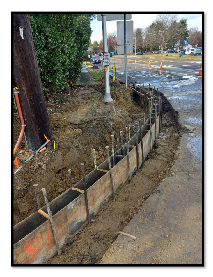
Photograph 1 – Curb forms in place for concrete pour at the S. Birchwood Park Drive intersection.