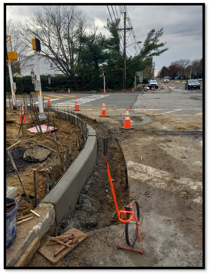
Photograph 2 – New concrete curb installed at the S. Birchwood Park Drive intersection.