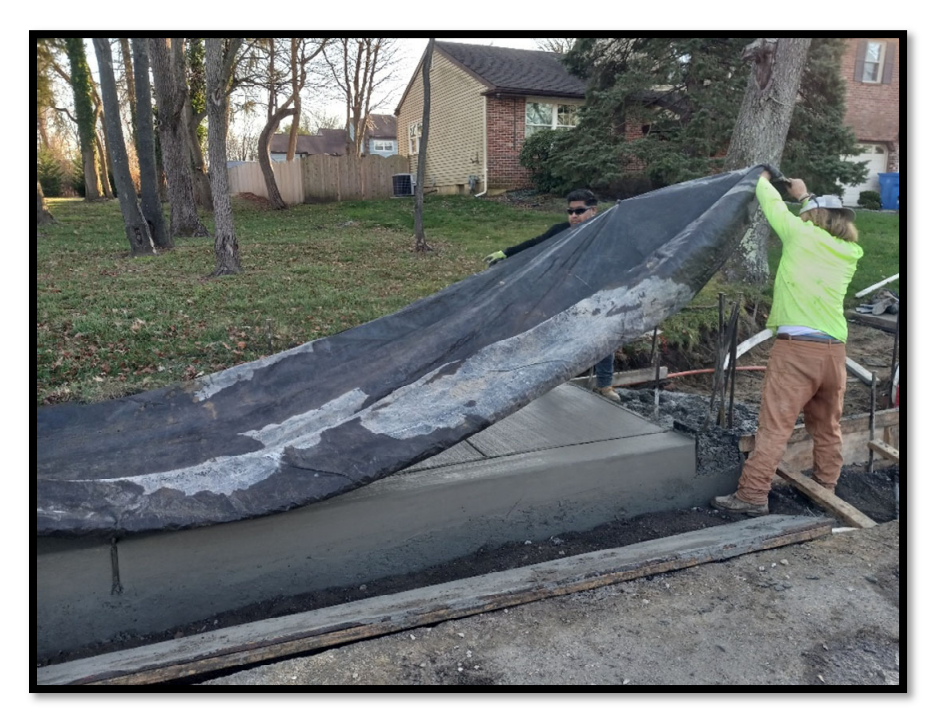
Photograph 6 – Concrete crew installing blankets to protect new sidewalk from overnight freezing temperatures.