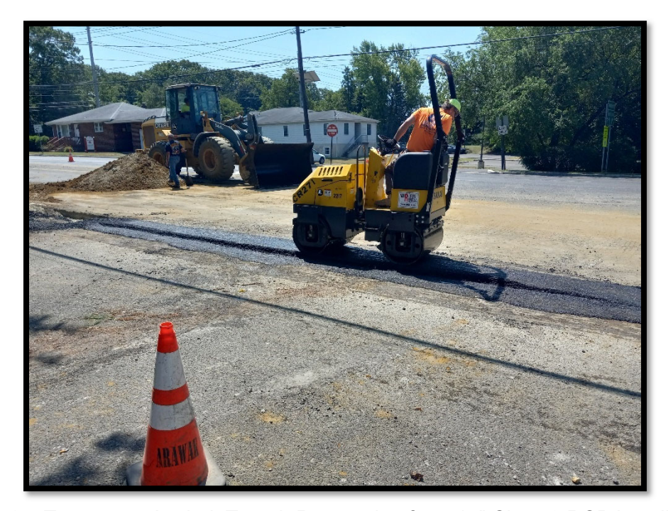
Photograph 6 – Temporary Asphalt Trench Restoration from 15" Class 3 RCP installation along the left side of Greentree Road between Linden Avenue and Princess Avenue.