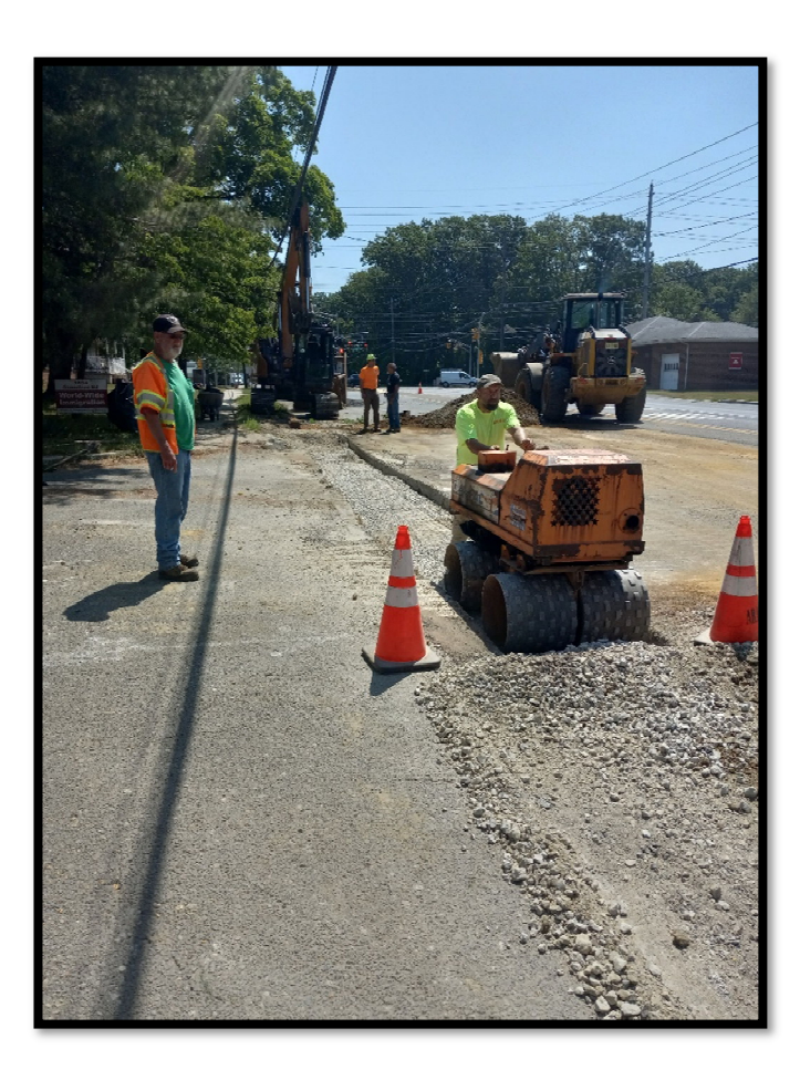
Photograph 4 - Backfilling trench with Dense Graded Aggregate from 15" Class 3 RCP installation along the left side of Greentree Road between Linden Avenue and Princess Avenue.