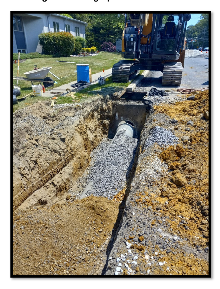
Photograph 1 – The subcontractor performing storm drainage improvements continued installing 15" Class 3 RCP along the left side of Greentree Road between Linden Avenue and Princess Avenue.