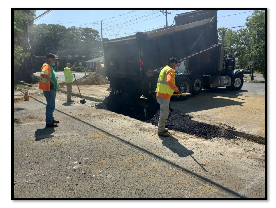
Photograph 5 – Temporary Asphalt Trench Restoration from 15" Class 3 RCP installation along the left side of Greentree Road between Linden Avenue and Princess Avenue.

Department of Public Works Charles J. DePalma Complex 23ll Egg Harbor Road Lindenwold, NJ 0802l Phone 856.566.2980 Fax 856.566.2988 highway@camdencounty.com CamdenCounty.com