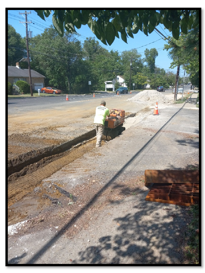
Photograph 3 – Backfilling trench from 15" Class 3 RCP installation along the left side of Greentree Road between Linden Avenue and Princess Avenue.