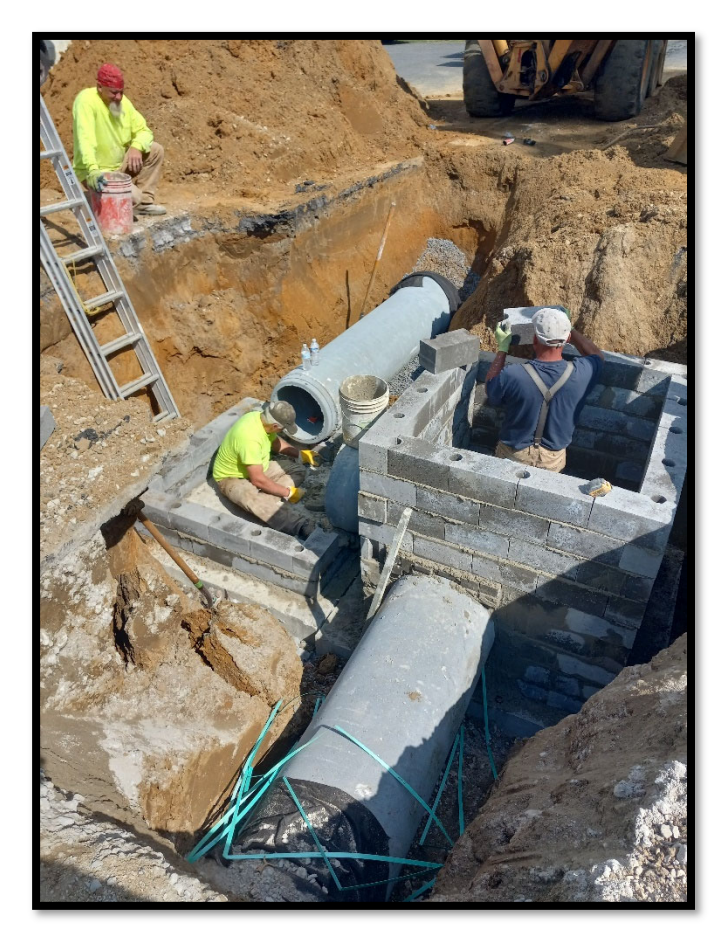
Photograph 4 – Blockwork continues for "B" Inlet at Station 120+75L. Two courses of block installed for adjacent manhole.