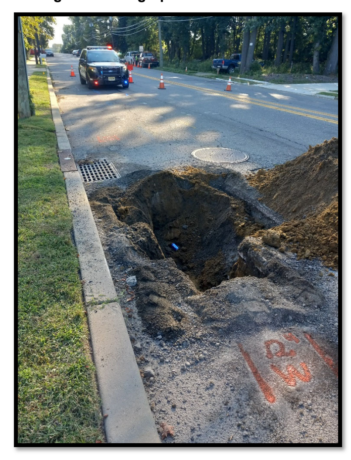
Photograph 1 – Pipe subcontractor digging test pits near Station 122+75 to locate existing 12" watermain.