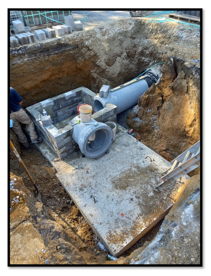
Photograph 3 – Precast slabs in place for "B" inlet and manhole being installed at Station 120+75L. Four courses of block installed for "B" inlet.