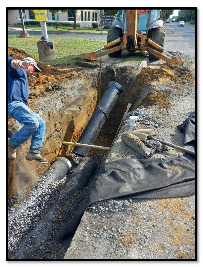
Photograph 8 - Dual 12" DIP storm pipe being installed to go under the 2" gas main servicing the Springdale Plaza Shopping Center.