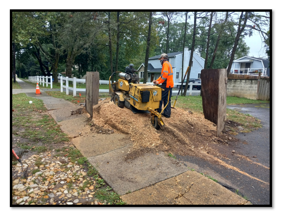
Photograph 6 – Tree subcontractor grinding stump at Station 127+75L.