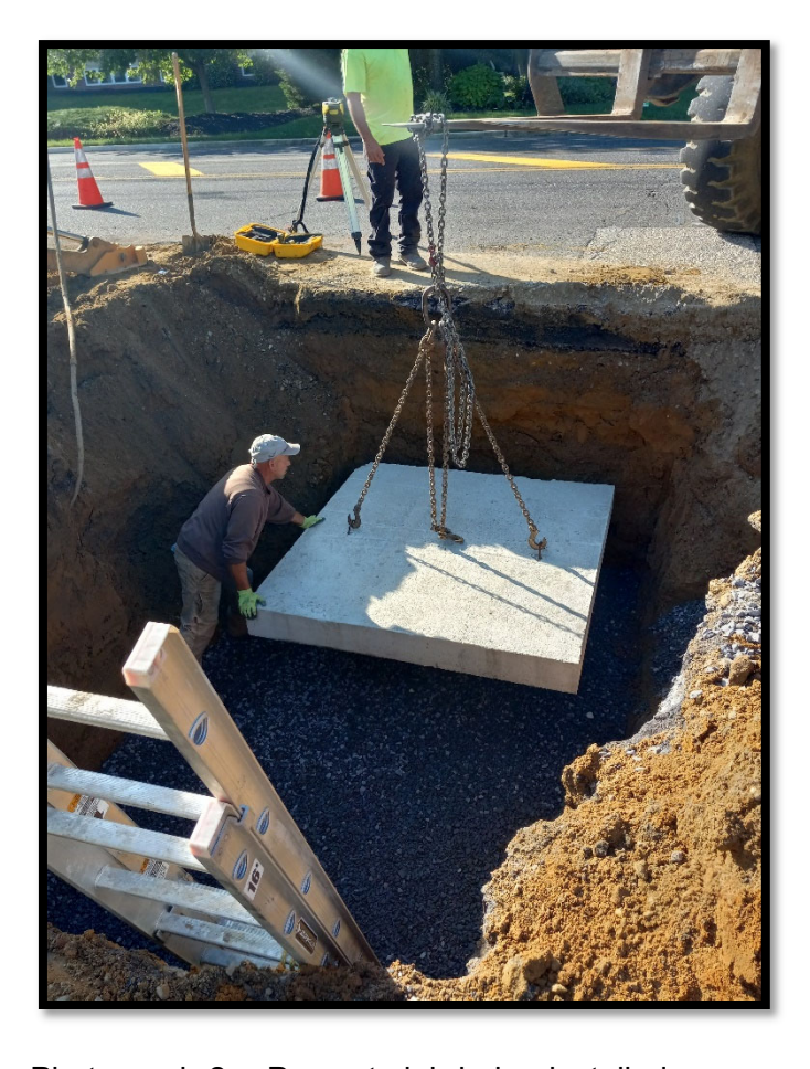
Photograph 2 – Precast slab being installed for "B" Inlet at Station 120+75L.