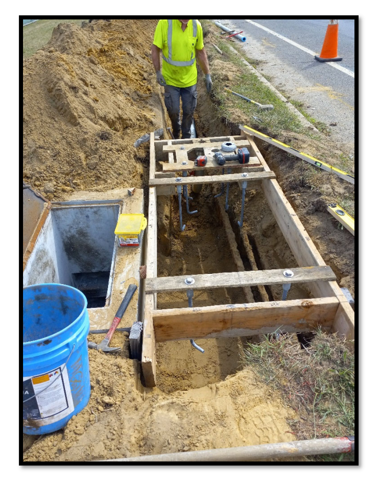
Photograph 4 – Electrical subcontractor installing formwork for concrete foundation pour for traffic signal upgrades at the S. Birchwood Park Drive intersection.