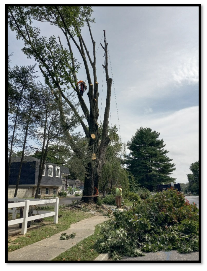
Photograph 3 – Tree subcontractor removing tree at Station 127+75L.

Department of Public Works Charles J. DePalma Complex 2311 Egg Harbor Road Lindenwold, NJ 08021 Phone 856.566.2980 Fax 856.566.2988 <u>highway@camdencounty.com</u> CamdenCounty.com