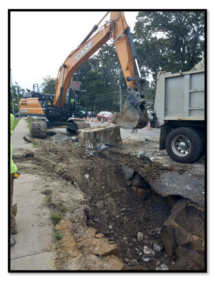
Photograph 1 – Pipe subcontractor demolishing existing inlet at Station 118+00L.