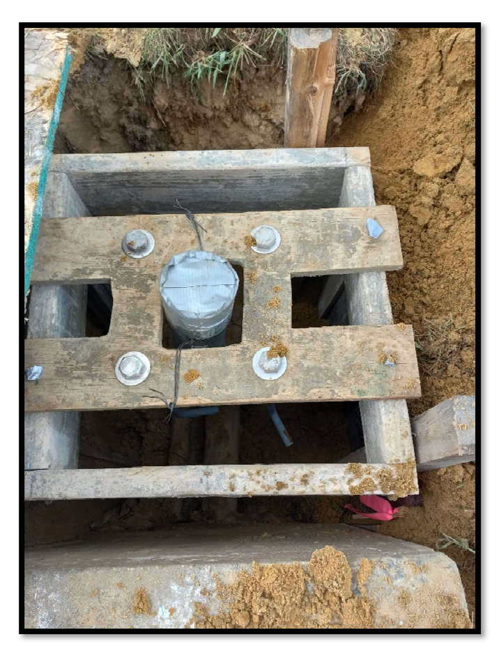
Photograph 9 - Rigid metal conduit, anchor bolts and formwork in place for concrete foundation pour for traffic signal upgrades at the S. Birchwood Park Drive intersection.