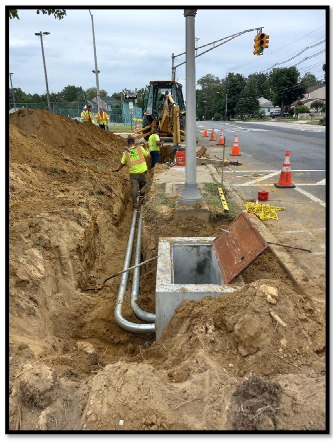
Photograph 6 – Electrical subcontractor installing junction box and rigid metal conduit for traffic signal upgrades at the S. Birchwood Park Drive intersection.