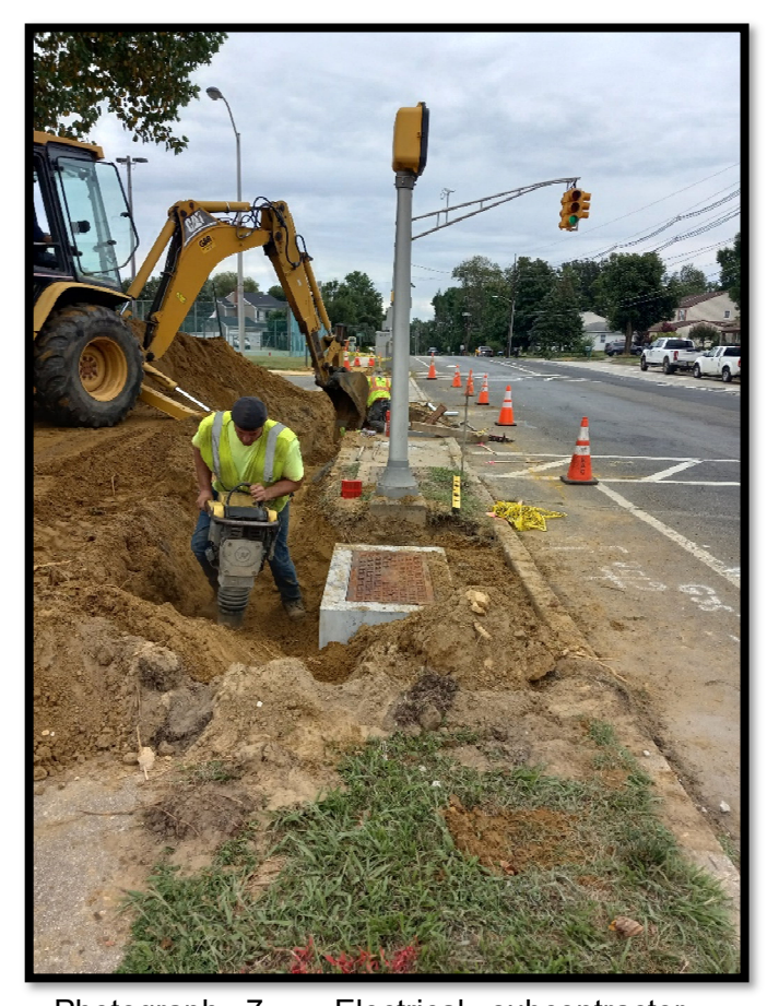
Photograph 7 – Electrical subcontractor backfilling trenches for junction box and rigid metal conduit for traffic signal upgrades at the S. Birchwood Park Drive intersection.