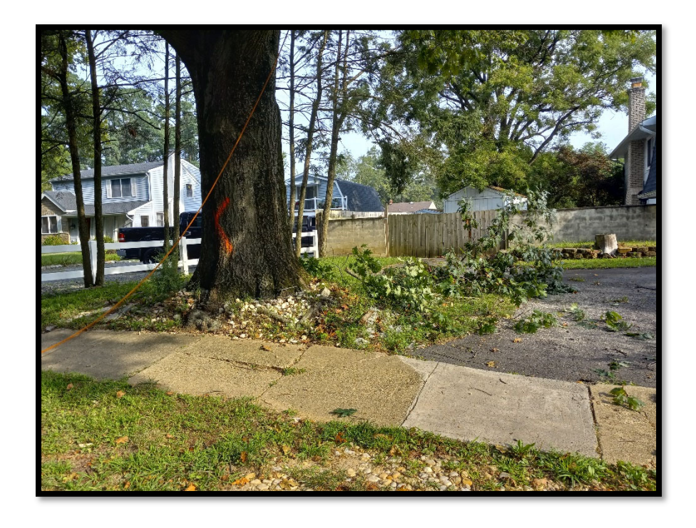
Photograph 1 – Tree subcontractor preparing to remove the tree at Station 127+75L.