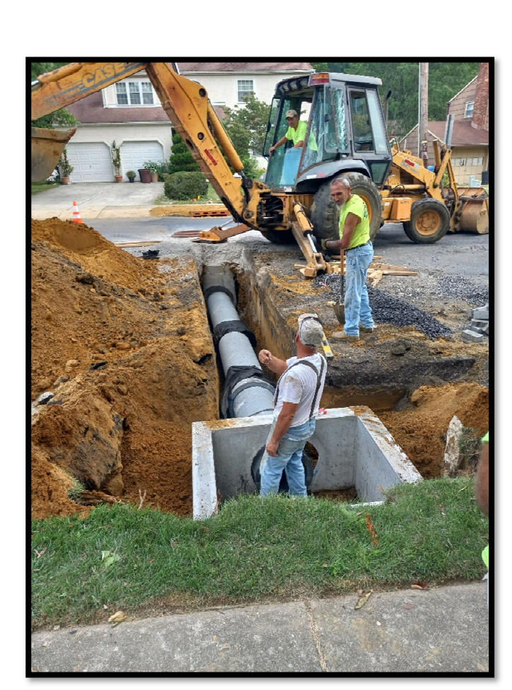
Photograph 4 – Pipe subcontractor installing 'B' inlet and corresponding 15" RCP cross drain at Station 144+60R.

Department of Public Works Charles J. DePalma Complex 23ll Egg Harbor Road Lindenwold, NJ 0802l Phone 856.566.2980 Fax 856.566.2988 highway@camdencounty.com CamdenCounty.com