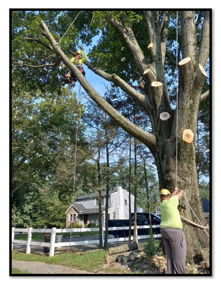
Photograph 3 – Tree subcontractor removing the tree at Station 127+75L.