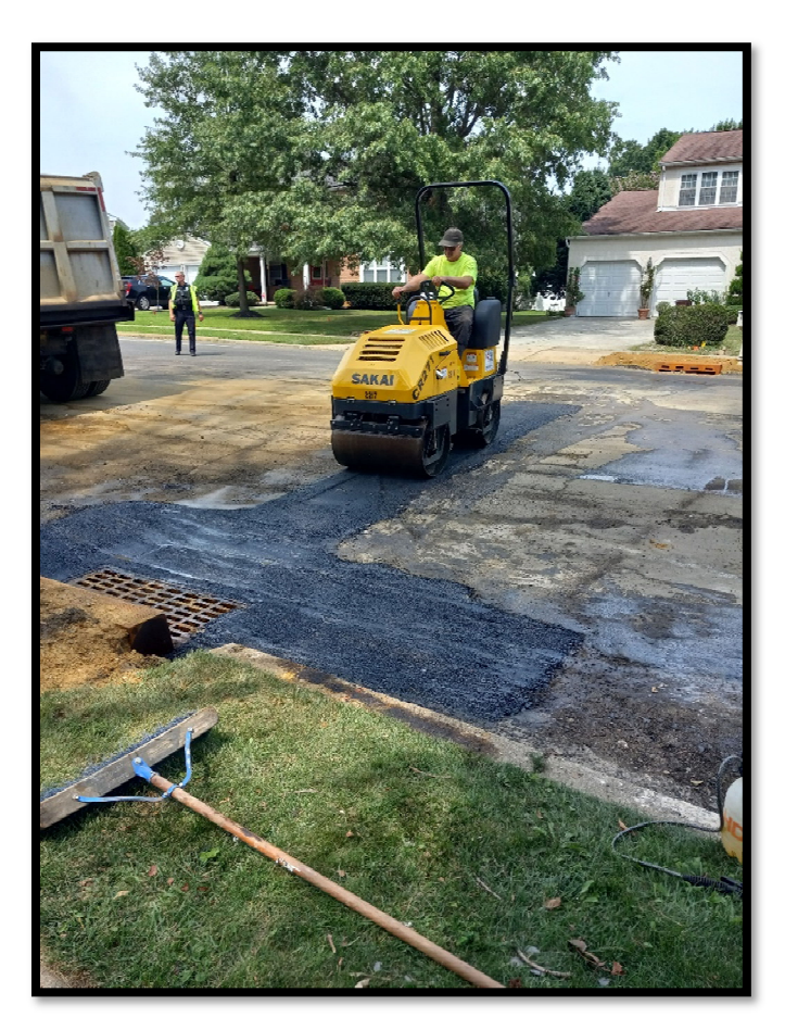
Photograph 5 – Asphalt Trench Restoration for 'B' inlet and corresponding 15" RCP cross drain at Station 144+60R.