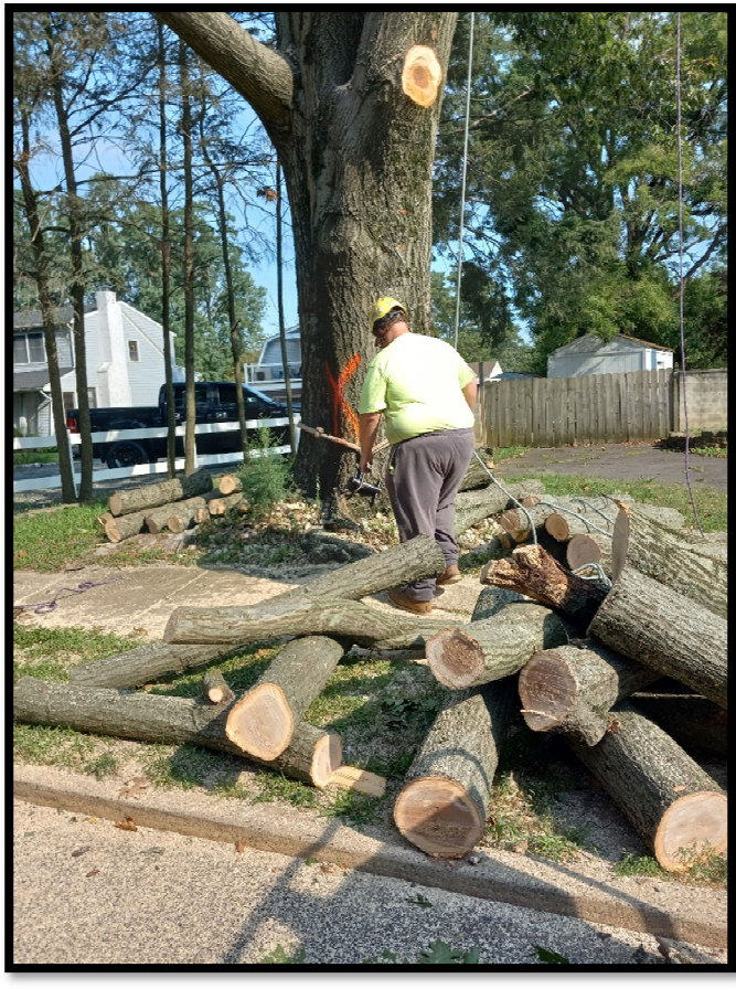
Photograph 2 - Tree subcontractor removing the tree at Station 127+75L.