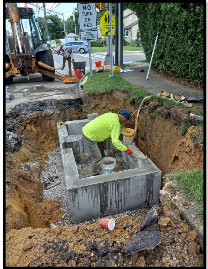
Photograph 3 – New precast Double “B” Inlet set at Station 138+75R.