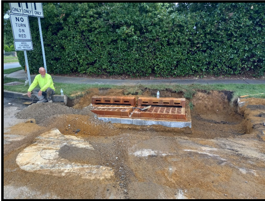
Photograph 3– New precast Double “B” Inlet with castings installed at Station 138+75R.