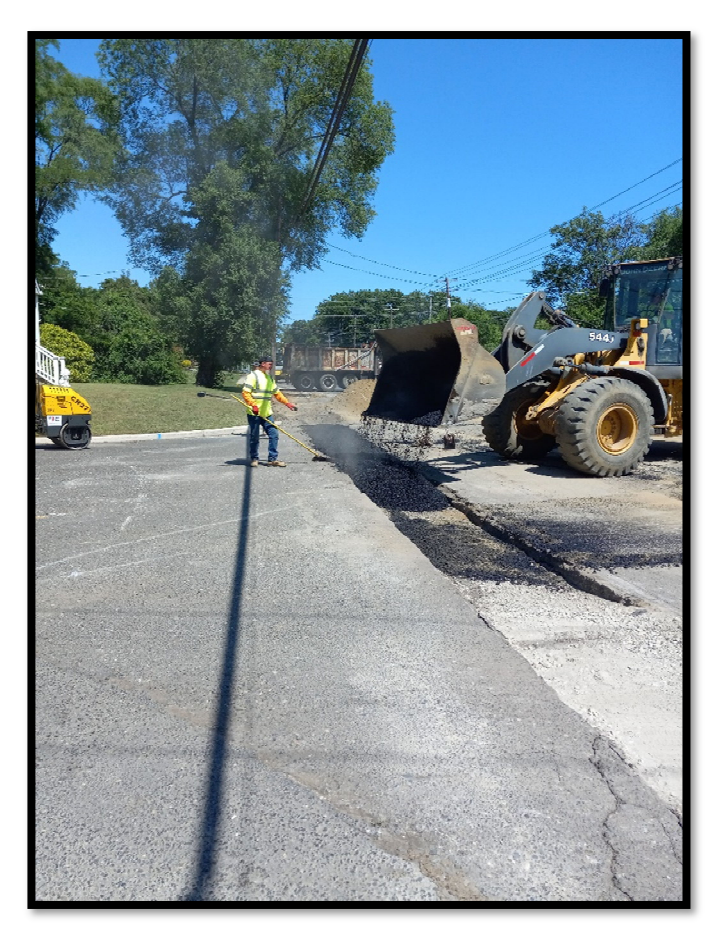
Photograph 13 – Temporary Asphalt Trench Restoration for 15" Class 3 RCP being installed along the left side of Greentree Road heading east from the inlet at Station 108+60L.