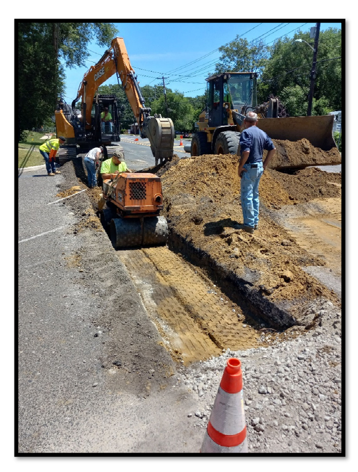
Photograph 12 – Backfilling 15" Class 3 Reinforced Concrete Pipe along the left side of Greentree Road heading east from the inlet at Station 108+60L.