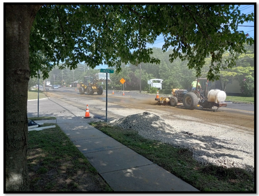
Photograph 15 – Cleaning of dirt and debris from the roadway prior to the weekend