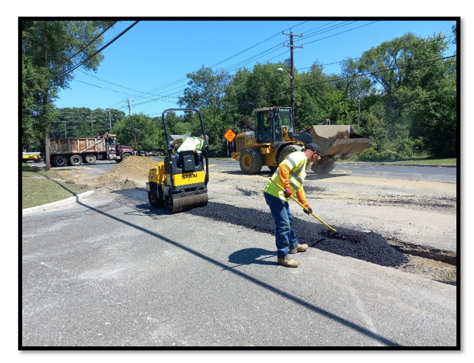
Photograph 14 – Temporary Asphalt Trench Restoration for 15" Class 3 RCP being installed along the left side of Greentree Road heading east from the inlet at Station 108+60L.