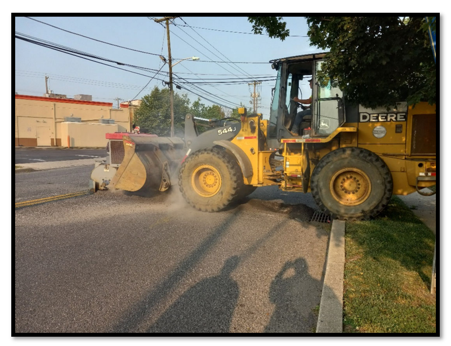
Photograph 2 – Milling trench for installation of 12" Cement Lined Ductile Iron Pipe crossdrain from the inlet at Station 103+40L.