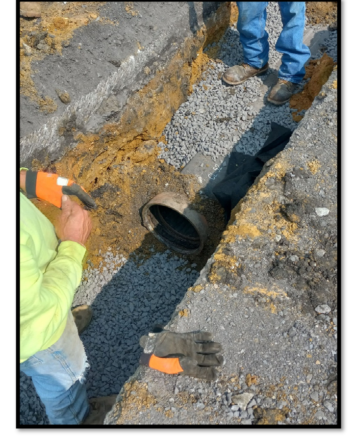
Photograph 4 – Trench excavation for 12" Cement Lined Ductile Iron Pipe for cross-drain from the inlet at Station 103+40L.