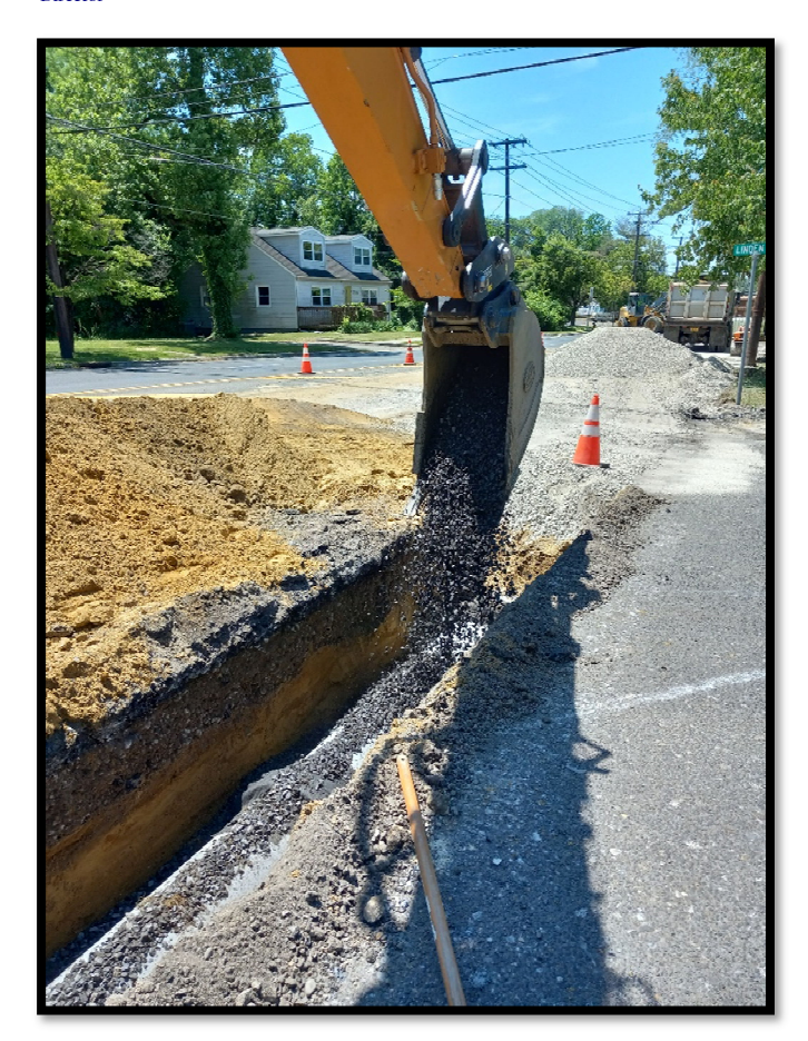
Photograph 10 – Backfilling 15" Class 3 Reinforced Concrete Pipe along the left side of Greentree Road heading east from the inlet at Station 108+60L.