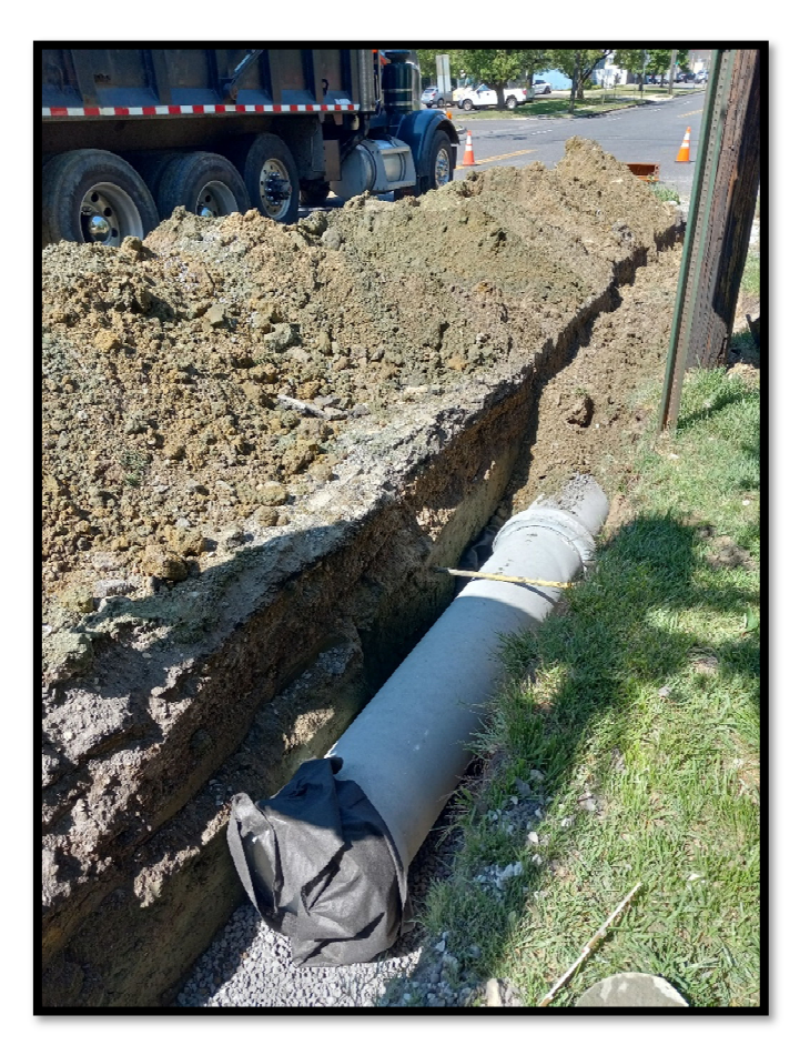
Photograph 9 - 15" Class 3 RCP being installed along the left side of Greentree Road heading east from the inlet at Station 108+60L.