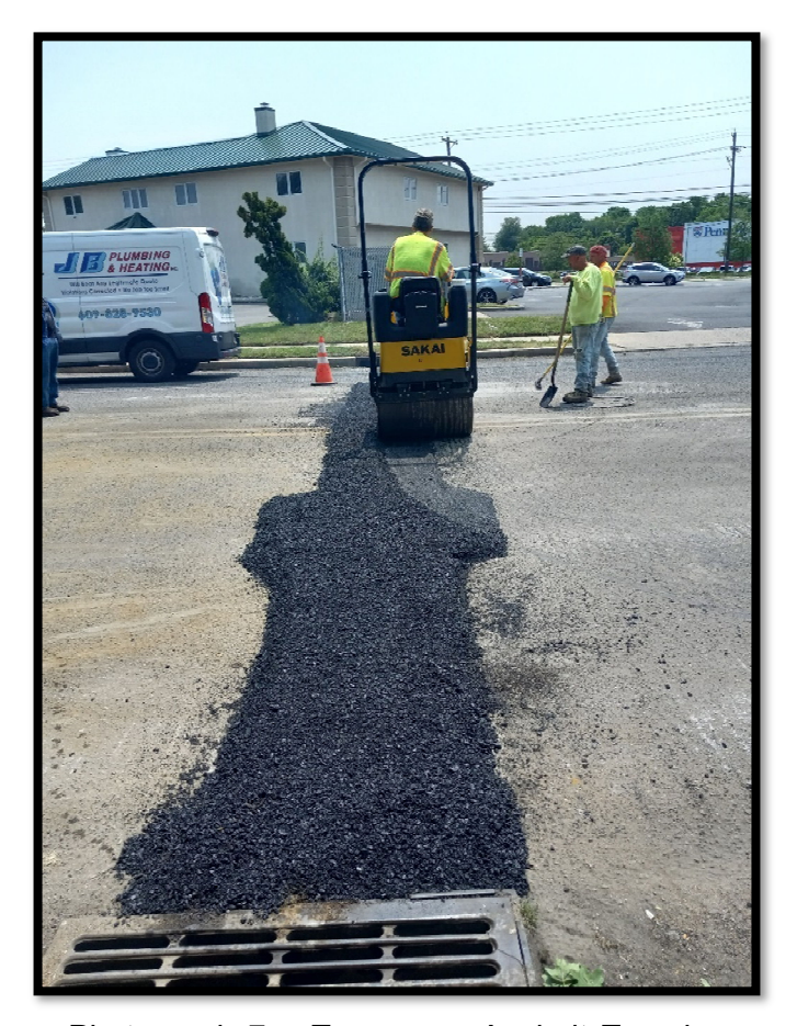
Photograph 7 – Temporary Asphalt Trench Restoration for 12" Cement Lined Ductile Iron Pipe installed for cross-drain from the inlet at Station 103+40L.