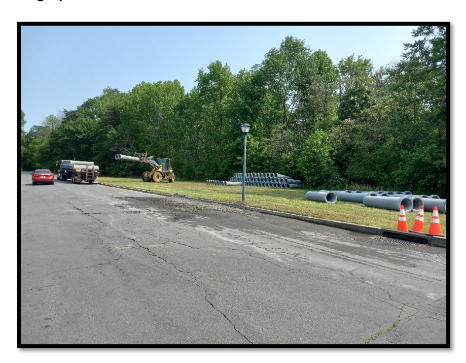
Photograph 1 – Reinforced Concrete Pipe for new drainage system being delivered to lay down yard adjacent to North Green Acre Drive.