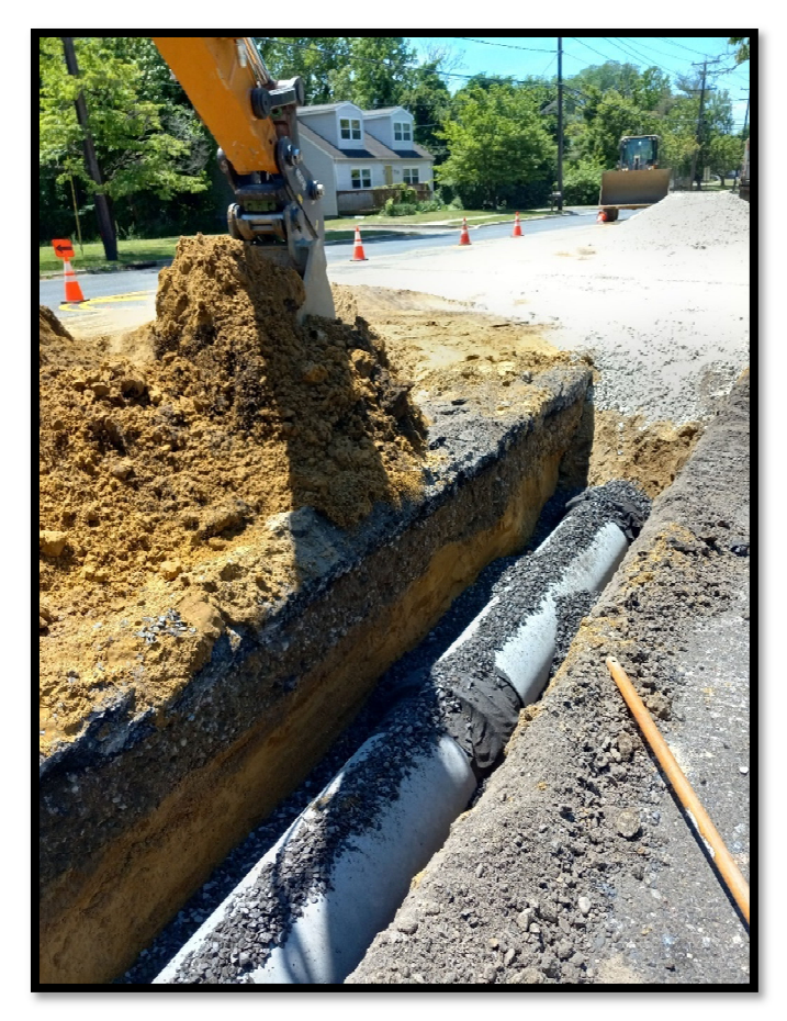
Photograph 11 – Backfilling 15" Class 3 Reinforced Concrete Pipe along the left side of Greentree Road heading east from the inlet at Station 108+60L.