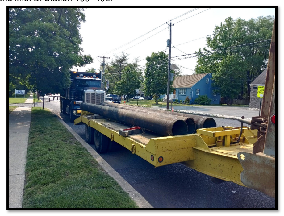
Photograph 3 – Delivery of 12" Cement Lined Ductile Iron Pipe for cross-drain from the inlet at Station 103+40L.