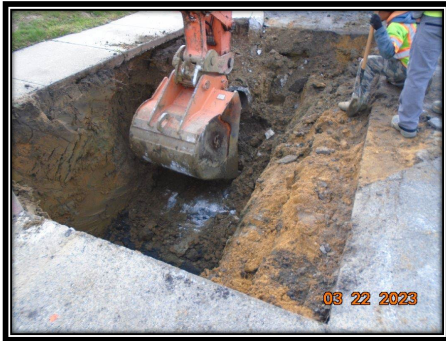
Figure: 2 – Removal of existing Type B Inlet along the northbound lane at the intersection with Poplar Avenue