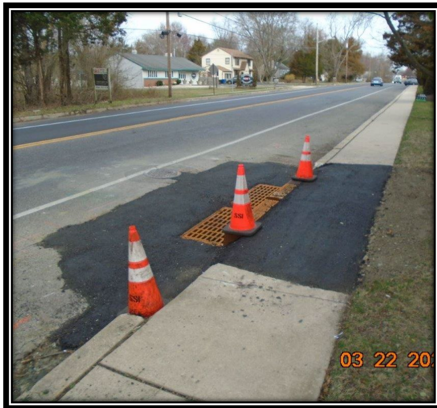
Figure: 3 – HMA restoration in front of newly installed Type B Inlet and temporary HMA sidewalk along the northbound lane between Britton Place and Cedar Avenue