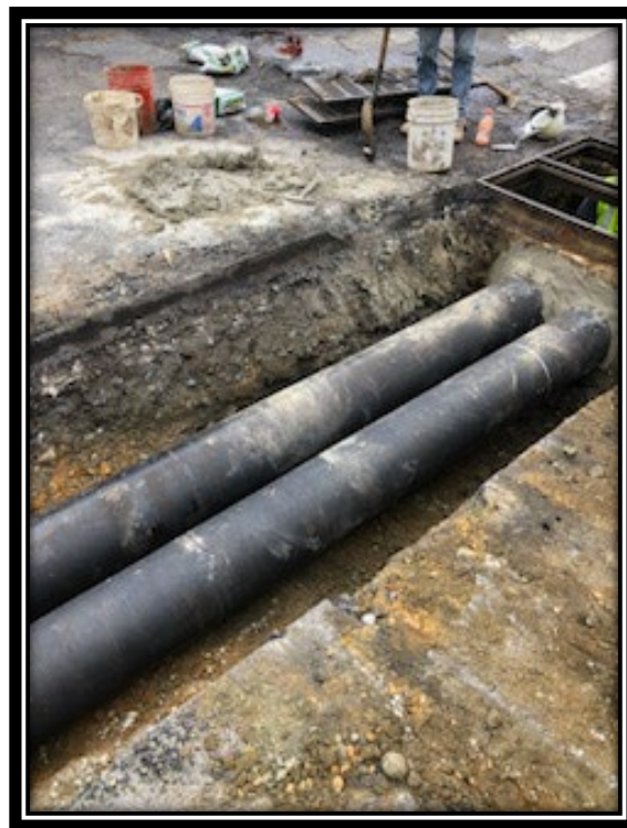
Figure: 3 – Installation of twin 12” DIP along the eastbound lane between Kings Croft Drive and the County Border