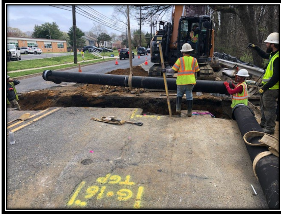
Figure: 2 – Installation of 12” DIP crossing between Kings Croft Drive and the County Border