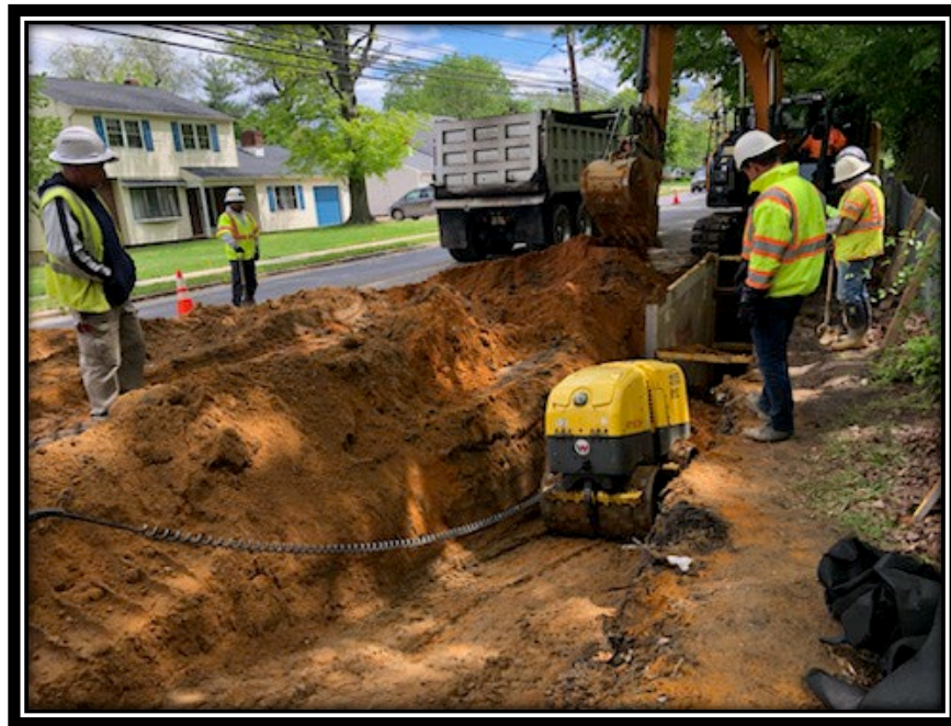
Figure: 3 – Compaction of newly installed 18” RCP trench along the eastbound lane between Millstream Drive and Friendship Lane