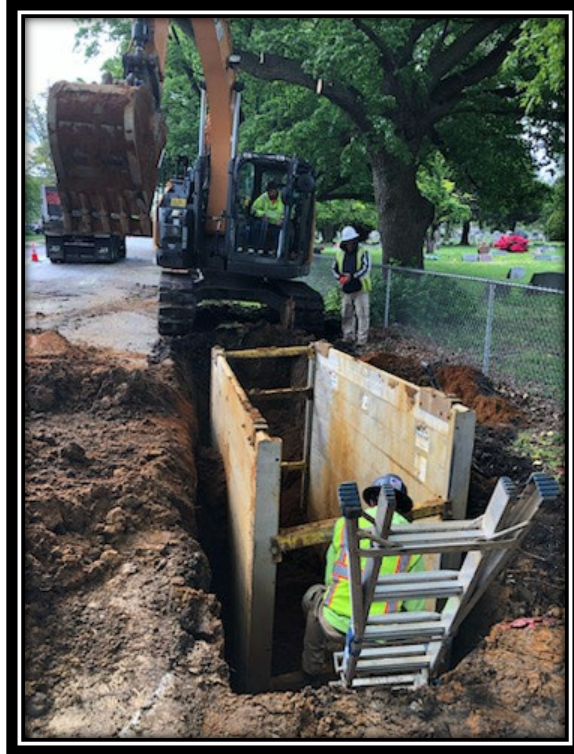
Figure: 2 – Installation of 18” RCP storm sewer along the eastbound lane between Millstream Drive and Friendship Lane