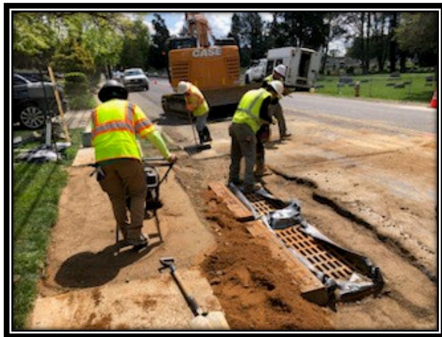
Figure: 3 – Restoration behind newly installed of Double Inlet along the westbound lane between Millstream Drive and Friendship Lane