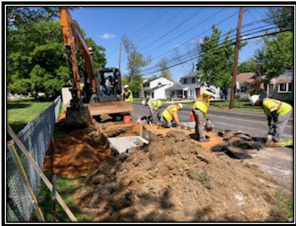
Figure: 1 – Installation of Double B Inlet along the eastbound lane between Millstream Drive and Friendship Lane