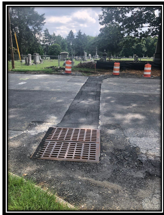
Figure: 3 – HMA trench restoration over newly installed 12” DIP storm sewer at the intersection with Friendship Lane