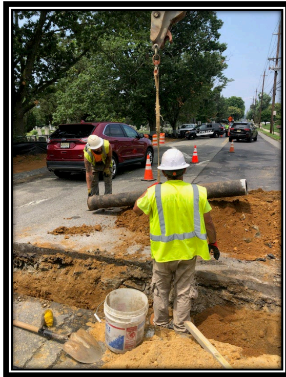
Figure: 2 – Installation of 12” DIP storm sewer at the intersection with Friendship Lane