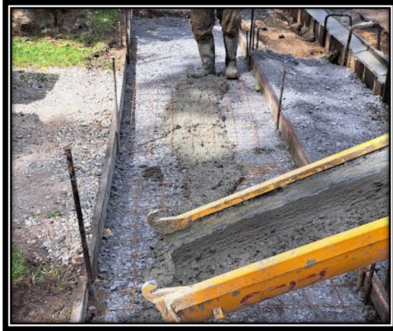
Figure: 2 – Installation of concrete curb, sidewalk and driveway apron along the eastbound lane between Columbia Boulevard and Lake Drive East