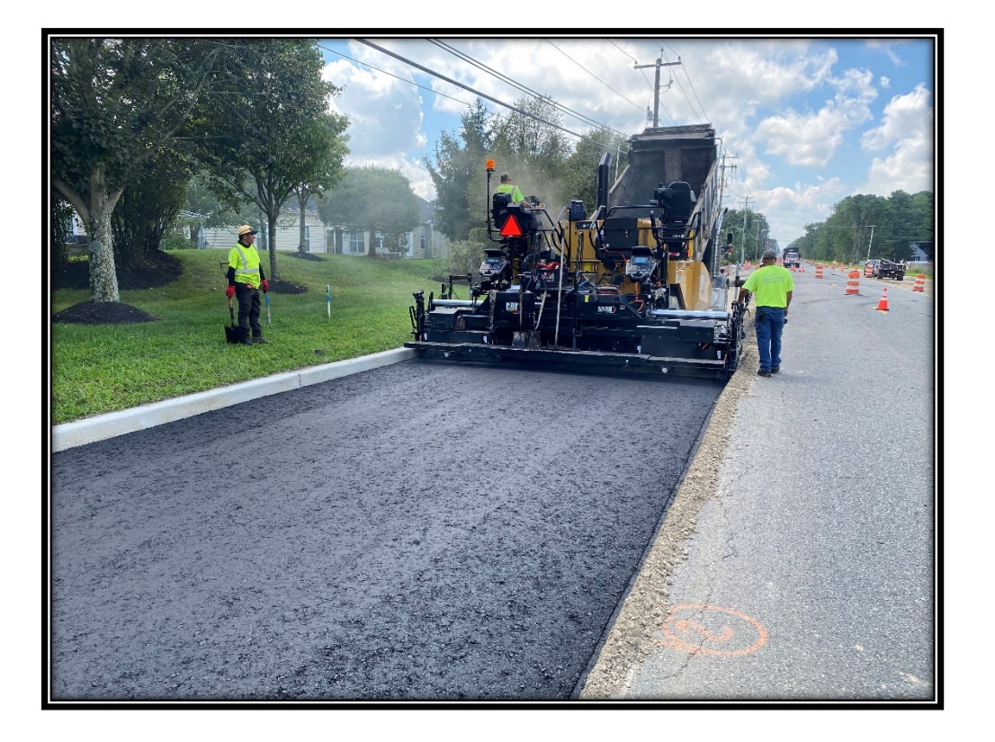
Figure: P&A Construction continues to install the hot mix aspahlt, using their brand new CAT AP 1055.

Progress Report #48 Monday, August 14, 2023 to Friday August 18, 2023