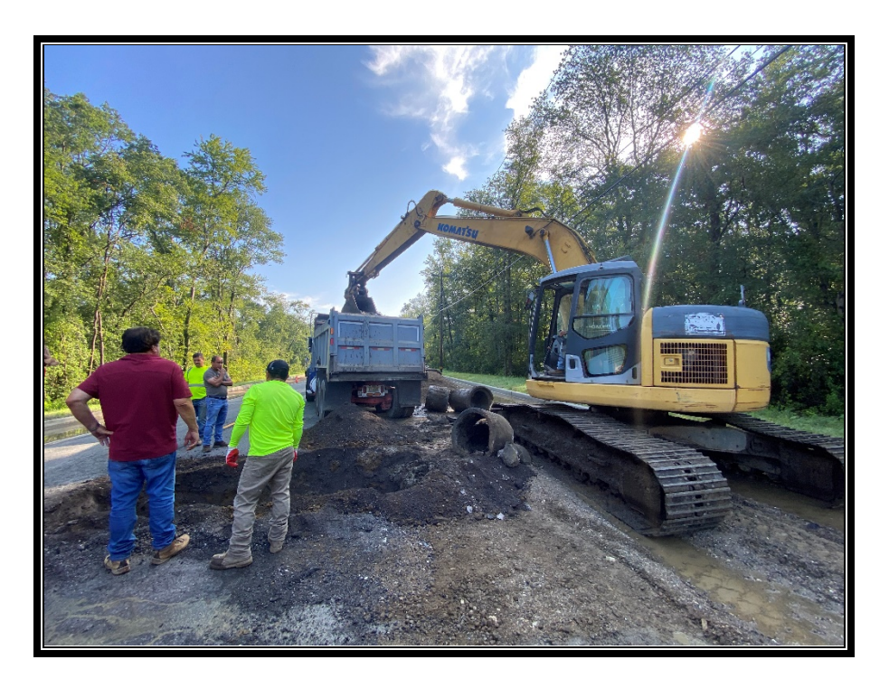
Figure 3: P&A Construction removing an existing 24" R.C.P.