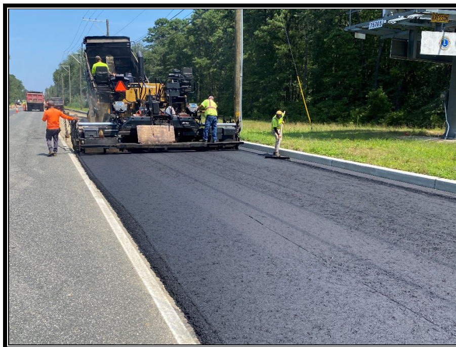
Figure 3: P&A Construction continues to pave the base course.