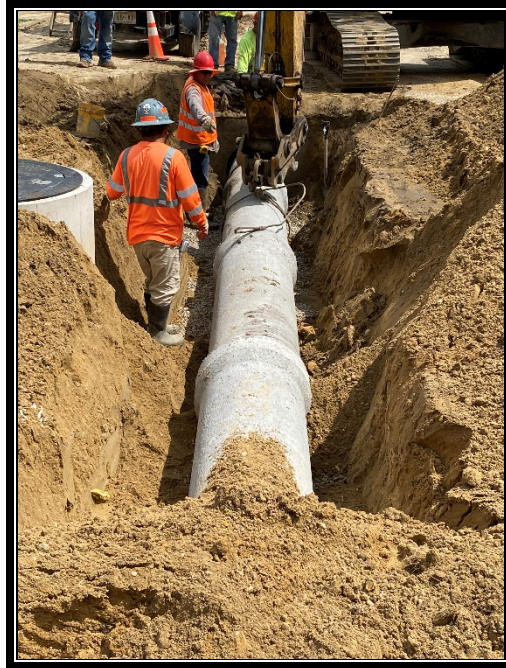
Figure 2: P&A Construction completes the installation of the reinforced concrete pipe.