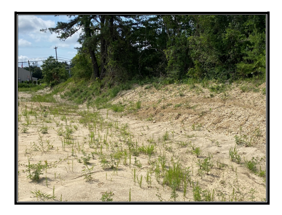
Figure 3: Reviewing additional topsoiling and seeding in the off-site easement.