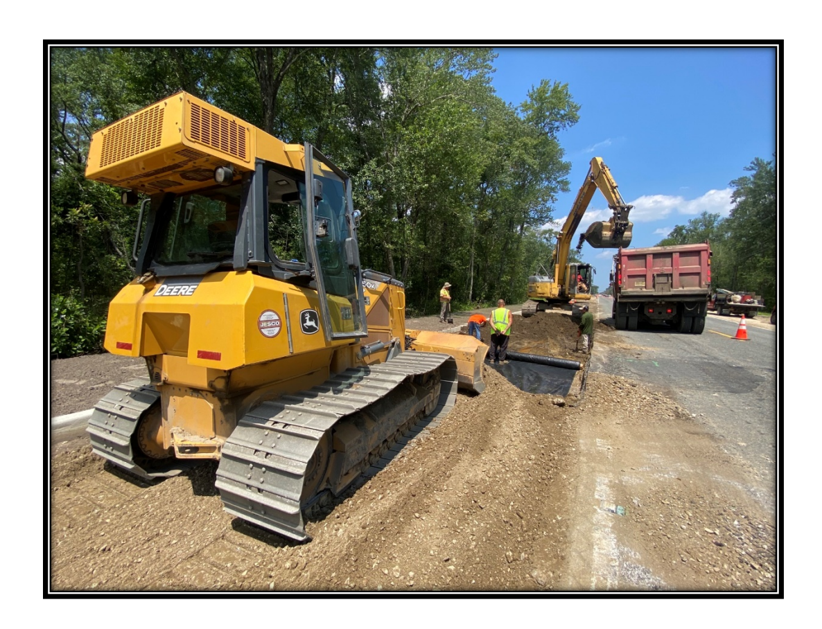
Figure: P&A Construction continues to excavate and install dense graded aggregate.

Progress Report #45 Monday, July 24, 2023 to Friday July 28, 2023