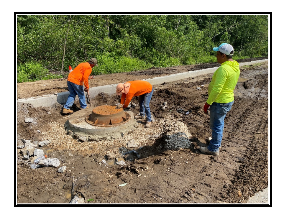
Figure 3: P&A Construction set drainage structures to finished grade.