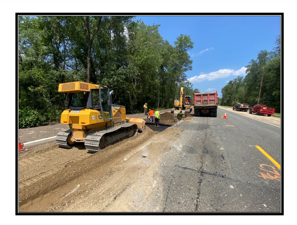
Figure 2: P&A Construction excavated roadway and installed DGA Base Course.

Department of Public Works Charles J. DePalma Complex 2311 Egg Harbor Road Lindenwold, NJ 08021 phone 856.566.2980 fax 856.566.2988 highway@camdencounty.com CamdenCounty.com