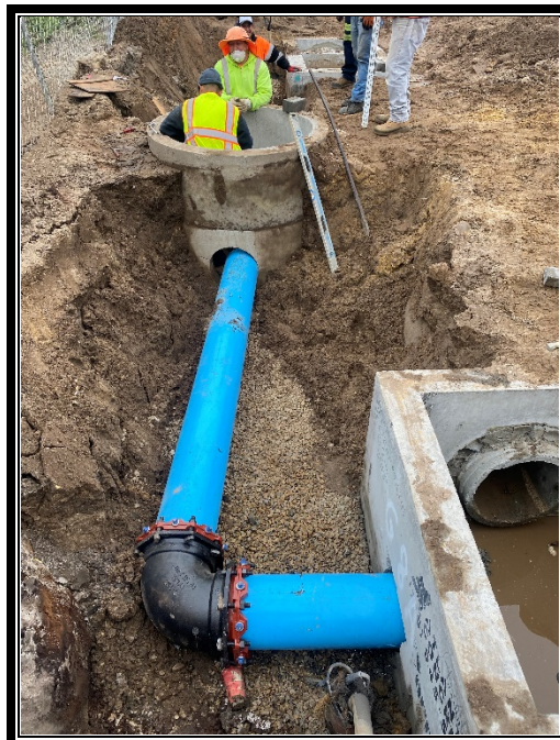
Figure 3: P&A Construction crew installing pipe at Water Quality Chamber.