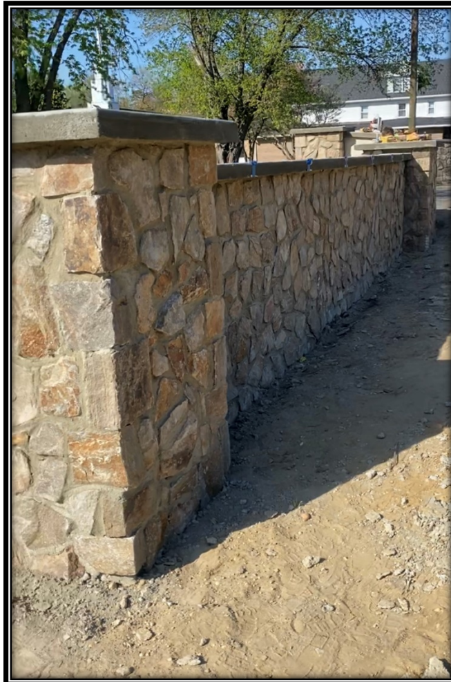
Figure: P&A Construction completed the decorative wall at Mater Ecclesiae.

Monday, April 24, 2023 to Friday April 28, 2023