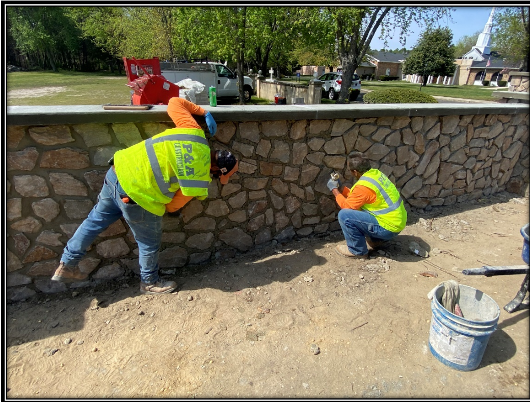
Figure: P&A Construction continues to reconstruct the decorative wall.

Monday, April 17, 2023 to Friday April 21, 2023