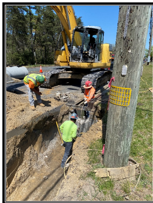
Figure 3: P&A Construction crew tying new pipe into existing inlet.