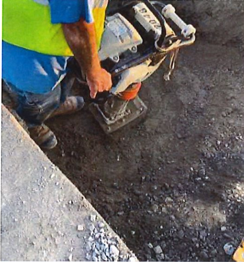
Figure 2: Compacting DGA