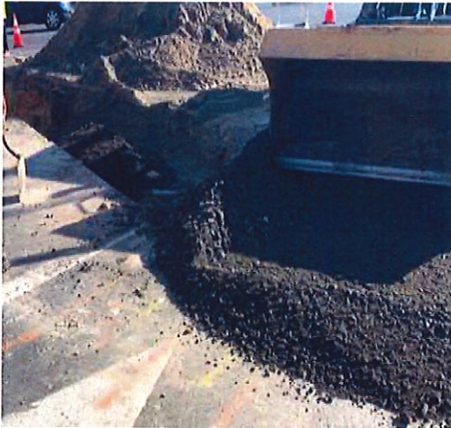
Figure 4: Installing DGA