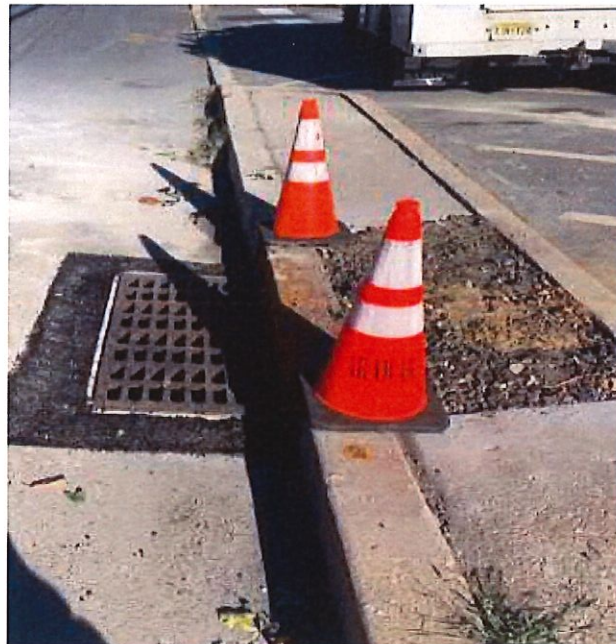
Figure 1: Inlet reconstruction area restored