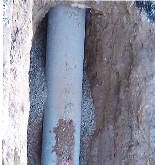
Figure 3: Section of RCP