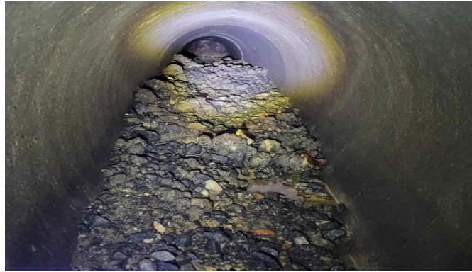
Figure 3: View from manhole towards inlet prior to cleaning