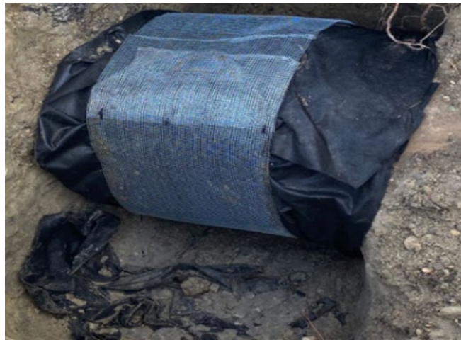
Figure 1: Two layers of wire on outside with layer of fabric paper in between