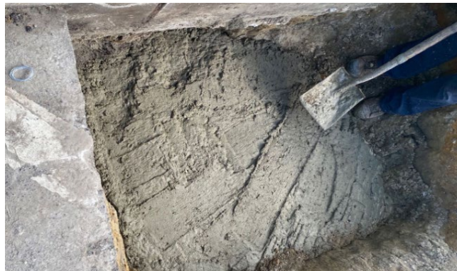
Figure 2: Concrete encasing pipe