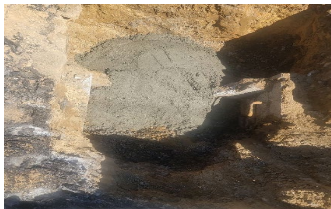
Figure 6: Pipes on both sides of inlet wall encased in concrete