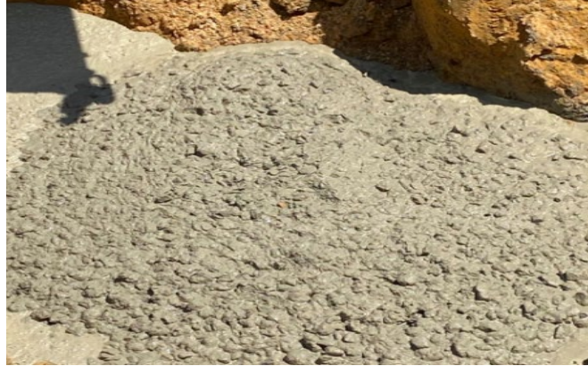
Figure 4: Pipe encased in poured concrete