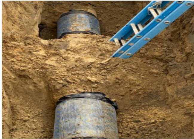
Figure 2: Both joints prepped for concrete placement