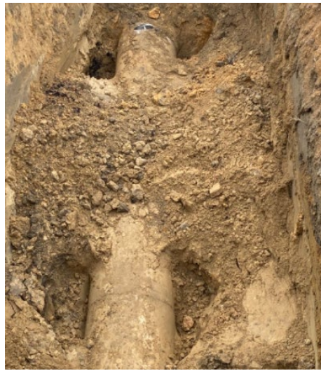
Figure 1: View of 12' pipe upon excavation