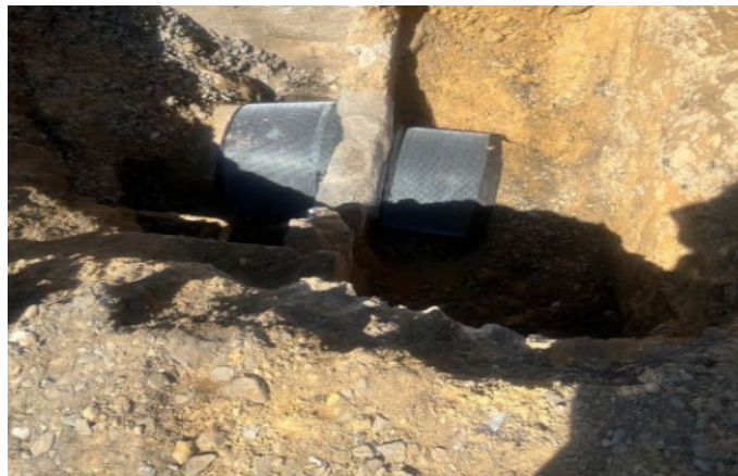
Figure 5: Pipe wrapped with fabric and wire on each side of inlet