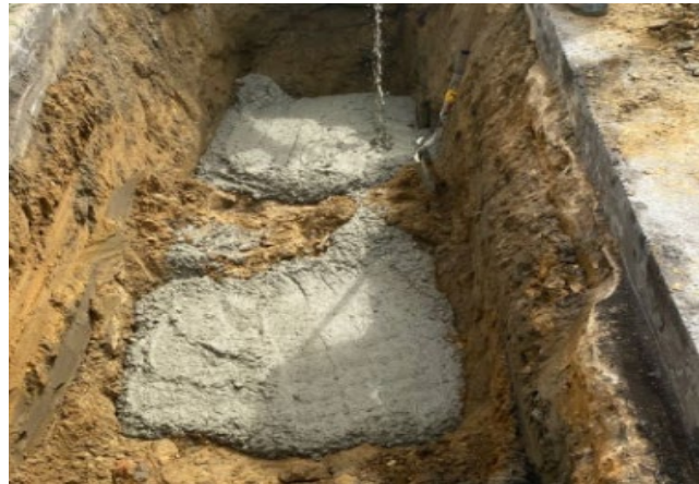
Figure 3: Concrete placement