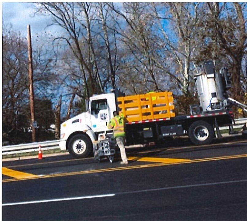
Figure 1: Striping