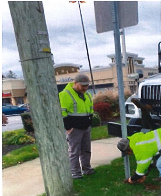
Figure 5: Sign removal