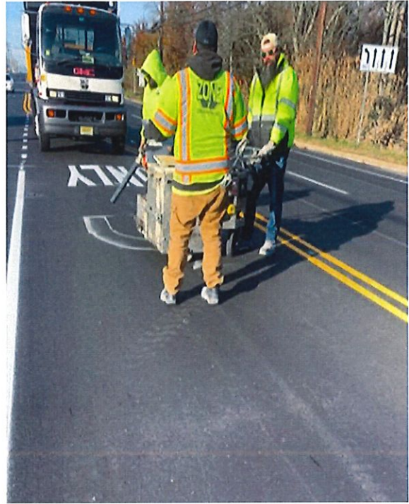
Figure 3: Striping