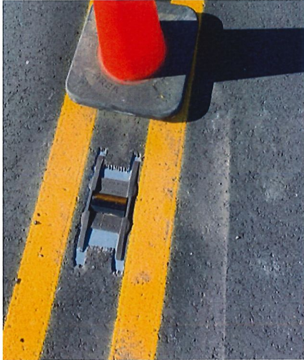
Figure 2: RPM