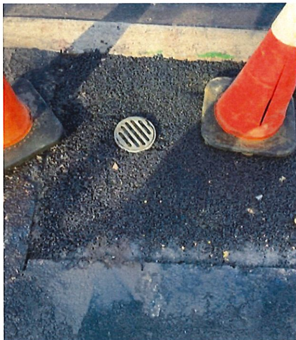
Figure 4: Clean out repaired