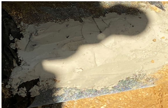
Figure 6: Mortar parged around wire mesh placed around separation