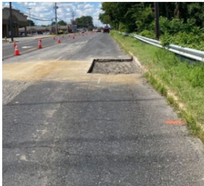
Figure 1: Westbound Blackwood Clementon Road work area