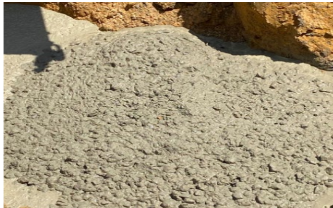
Figure 3: Pipe encased in concrete