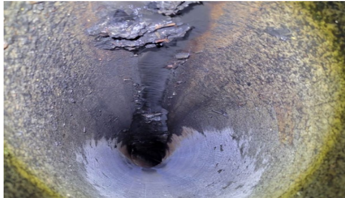
Figure 5: View of pipe interior from inlet towards manhole