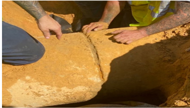
Figure 2: Separation in joint of pipe was fixed