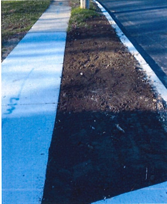
Figure 2: Topsoil