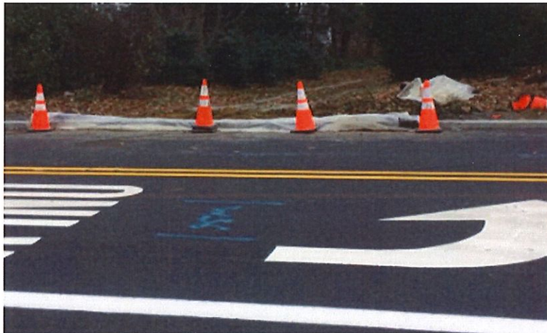
Figure 1: Concrete curb