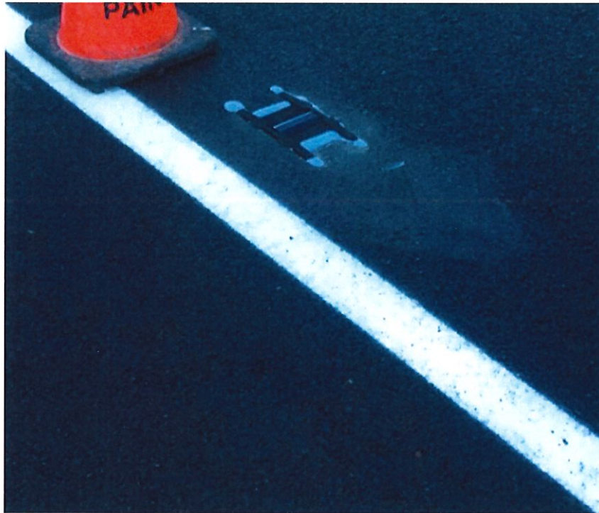
Figure 1: RPM Installation