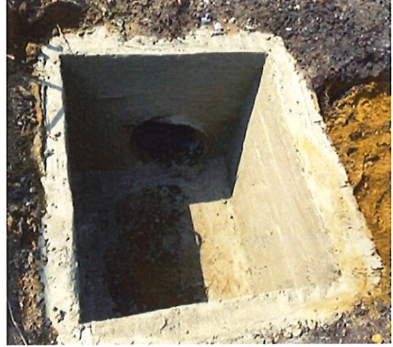
Figure 3: Reconstructed inlet