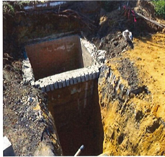
Figure 5: Reconstructed inlet