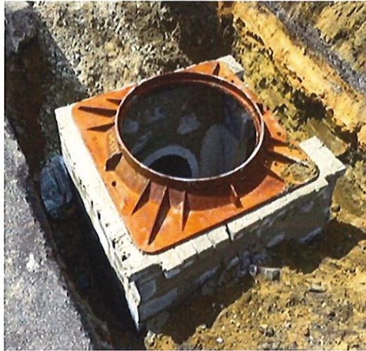
Figure 1: Manhole with frame