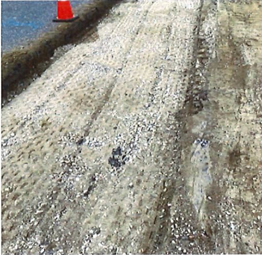
Figure 2: Compacted DGA