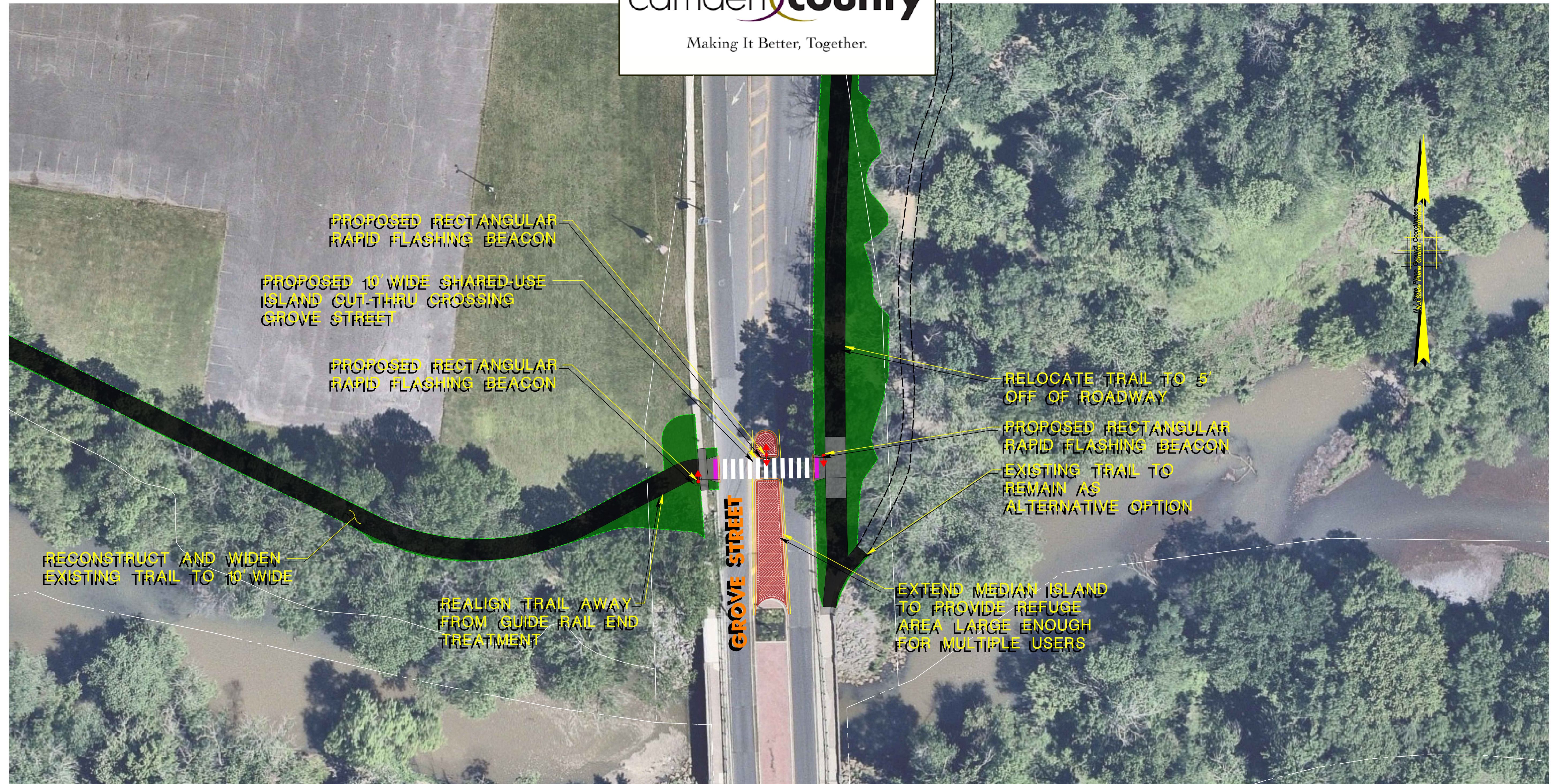
FIGURE 2 NOT TO SCALE