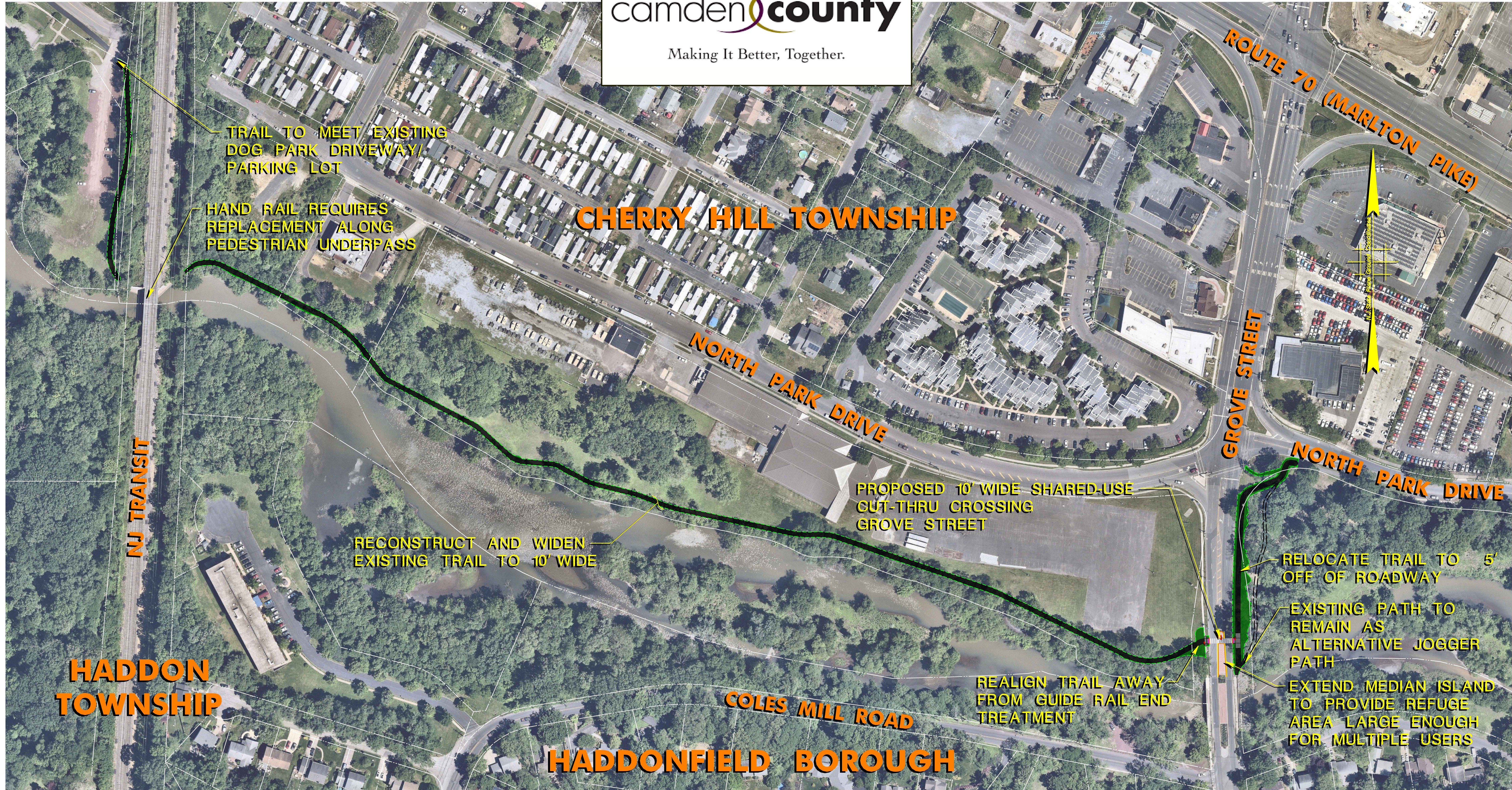
FIGURE 1 NOT TO SCALE