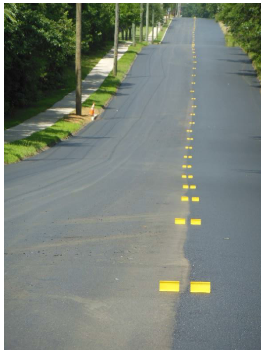
Figure 5 Paved roadway with temporary marked in center