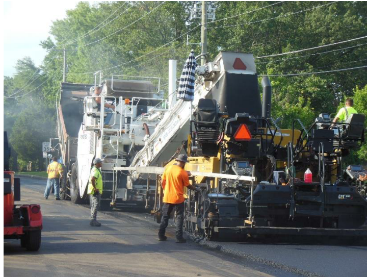
Figure 2 Paver being loaded by the MTV