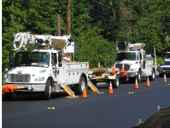
Figure 6 Verizon made it in to perform the pole transfer