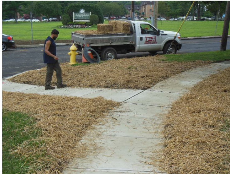
Figure 4 Straw mulch completed after seed was placed