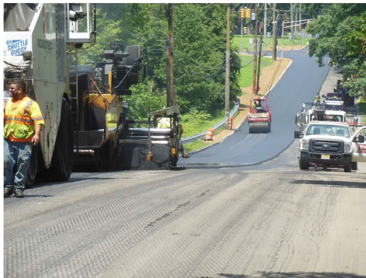
Figure 3 Paving train with roller in the background